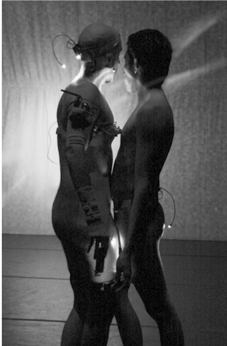
Fig. 3. Antibodies of Surveillance—Microdances. Performance by REVERSO. Festival Zona Híbrida, Madrid 2008.

Antibodies-Dissolution of the Body Politic is a “metamedia metafor- mance,” a political, artistic and technological intervention/performance/action