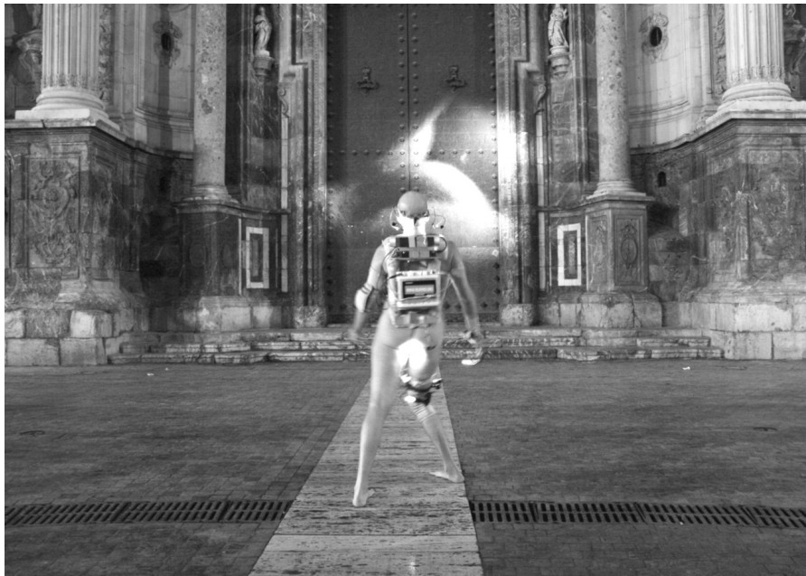
Fig. 2. Antibodies–Dissolution of the Body Politic. Performance by REVERSO. Alterarte-Murcia 2008.

The images, projected onto large translucent screens like a landscape of moving body fragments, are analyzed in real time and the outcoming movement parameters process the voice of the performers, spatialized in four channels, distorted until it becomes a fluid landscape, a granular chorus of multiple voices. Performers, wearing partial illumination on their bodies, are immersed in the same space with the audience, surrounded by large projections and sound, an intimate space for an intimate interface, where the performers move and interact with each other, and with the audience, whose skin may become part of the landscape, generating new uncertain possibilities of (post-intimate) relation.