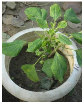
Fig. 1: Acalypha indica plant showing chlorotic symptoms due to infestation of root knot nematode, Meloidogyne incognita

Root-knot nematodes (RKNs), Meloidogyne spp., are distributed worldwide, and are obligate parasites of the roots of thousands of plant species. All major field crops, vegetable crops, turf, ornamentals, legumes and weeds are susceptible to one or more of the RKN species. This genus is considered the most important among plant-parasitic nematodes, mainly due to wide host range, which is known to exceed 3000 wild and cultivated plant species (Hussey & Janssen, 2002). About 96 nominal species of Meloidogyne have been described (Brito et al., 2008), but within the genus, M. arenaria , M. hapla , M. incognita , and M. javanica represent 95% of all infestations in agricultural lands (Hussey & Janssen, 2002). Infested plants show typical symptoms, which include root galling, stunting and nutrient deficiency. Infestation of roots by RKNs predisposes plants to the infection by other soil-borne root-infecting pathogens and causes disease complexes. Appearance of galls on plant roots usually indicates nematode reproduction on a weed or crop plant. Generally higher number of root galls, indicates greater nematode reproduction.