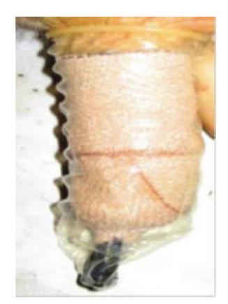
Figure 4: Suture site applied with Protectant and Bandaged.