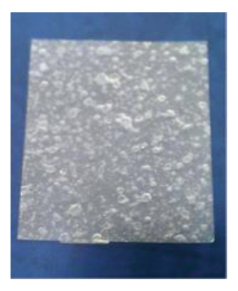
Figure 3: Collagen + calcium alginate teat protectants (3 x 3 cm sheet).

wound on the teat was irrigated with 0.5% Povidone lodine solution (Betadine-Win Medicare) and debrided sterile metal after inserting а teat siphon. Reconstruction of the exposed teat sinus was performed by suturing its edges in simple continuous pattern. Mattress sutures passing through the skin and subcutis on one edge and subcutis on other edge were employed using 3/0 polyglactin 910 (Vicryl Plus -Johnson and Johnson, Mumbai). Postoperatively, the teats were protected with Povidone iodine gauze in biodegradable teat protectants in the form of sheet (3 x 3 cm in size) made up of bovine collagen and calcium alginate mixture manufactured and sterilized with Gamma radiation (Figure 3) in control and treatment groups respectively. The teat applied with protectants were kept in position by adhesives and protected from contamination by applying a sterile condom over the entire teat (Figure 4). Milk from the quarter was drained daily and infused the teat cistern with intramammary infusion containing Metronidazole and Povidone Iodine. Inj. Streptopenicillin @ 10mg/ kg body weight was administered intramuscularly daily for 5 days in all the animals. The wound dressing was done on 5th postoperative day in all the animals.