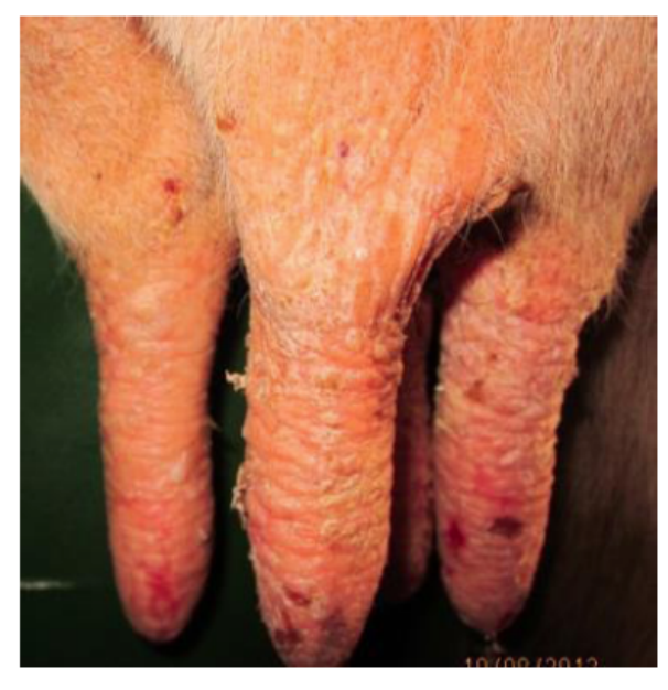
Figure 5: Group II: Teat showing complete wound healing on 10<sup>th</sup> day postoperatively.

without any appreciable complications. It also aided in restoration of the healthy status of the teat and the functional capacity of the teat in all the cows in the treatment group.