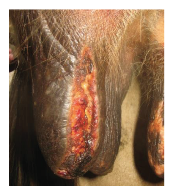
Figure 1: external teat wound.

A total number of 36 cross bred jersey cows with external teat injury without involving the teat cistern (Figure 1) and with exposed of teat sinus (Figure 2) were subjected for the present study. All the cows were cross bred Jersey. Clinical examination of the teat for its, teat shape, length, distance from the ground and etiology of the teat wounds were recorded. Following preoperative evaluation, the animals were divided into control group with 12 animals treated with Povidone iodine and treatment group with 24 animals each. In control (Group I) the external wound was sutured as per the standard procedure and protected with gauze with Povidone iodine solution. In treatment (Group II), after suturing the wound was protected with sheets of collagen and calcium alginate as protectants.