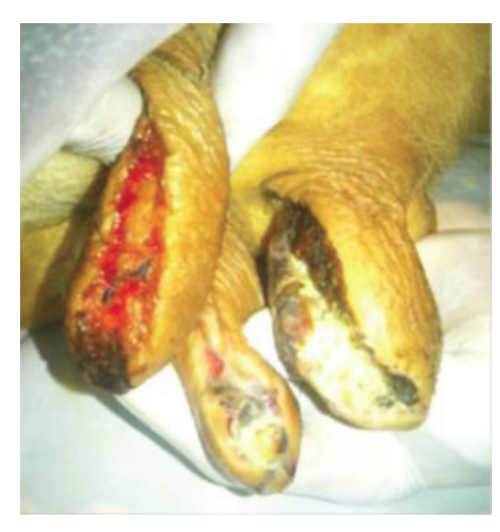
Figure 2: Exposed teat cistern.

Animal particulars, Morphometric details like shape of the udder and teats were recorded.