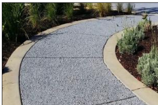
Figure 2. Pervious concrete application in sidewalks [8]