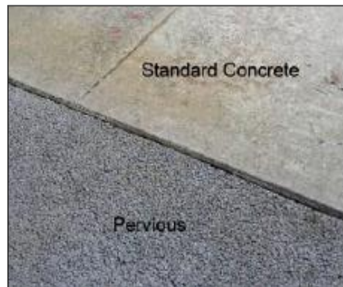
Figure 1. Comparison of pervious and conventional concrete [4]

The applications of pervious concrete are or can use for low volume pavements; residential roads and walkways; sidewalks and pathways; parking lots; tennis court; slop stabilization; floors for fish hatcheries and floors for zoos or children park etc. Pervious concrete is among one technology to allow rain or storm water to infiltrate into the ground rather than waste on the ground surface; mainly high compressive strength with high permeability in the previous concrete is the attention among researcher. This study is an attempt to reduce sand in the consecutive order proportion till 100% reduction of sand from the previous concrete to determine the compressive strength and infiltration rate; also find the optimum sand proportion to produce pervious concrete. The comparison of pervious concrete with standard concrete is shown in Figure 1[4] and the application of pervious concrete in sidewalks is shown in Figure 2[2].