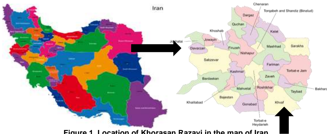
Figure 1. Location of Khorasan Razavi in the map of Iran

The data were entered into the SPSS software (version 23, IBM Corporation, Armonk, NY, USA). Mean and standard deviation (SD) were used for descriptive statistics of the data and chi-square test (or Fisher’s exact test) was conducted for data analysis. P-values < 0.05 were considered to indicate statistical significance.