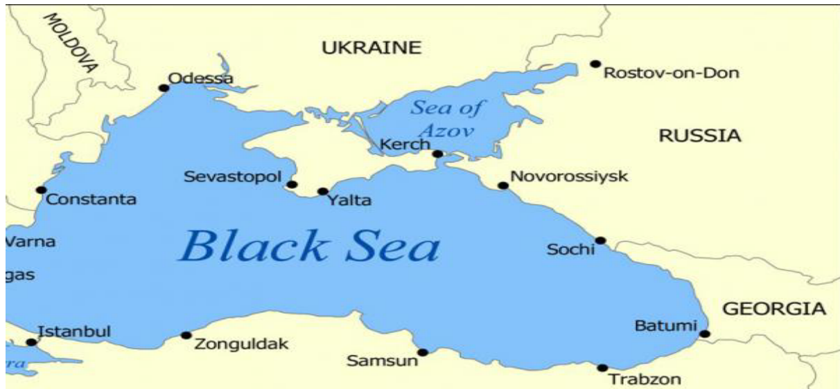
Figure no. 2. Countries with access to the Black Sea