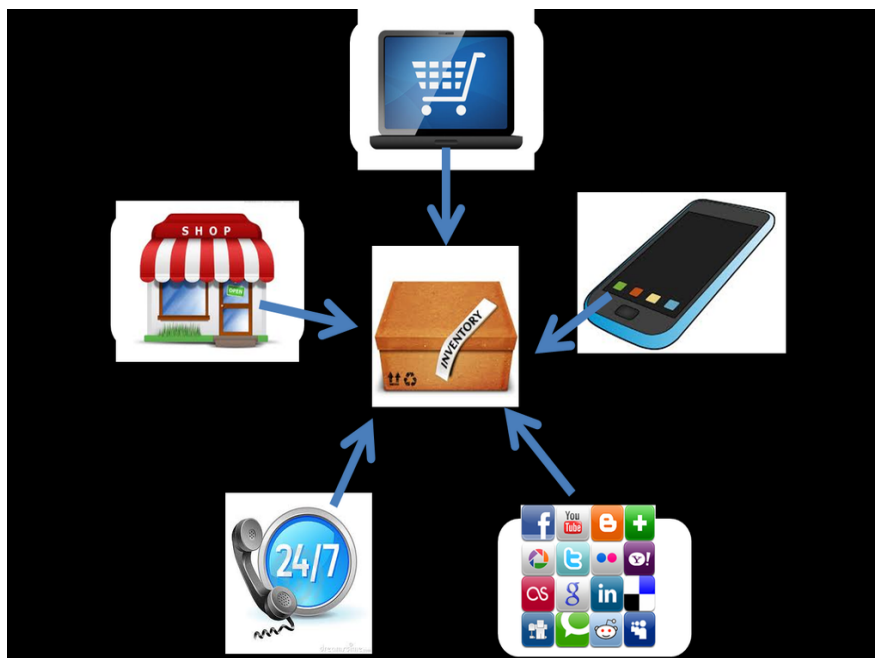
Figure no. 3 Omni-channel retailing