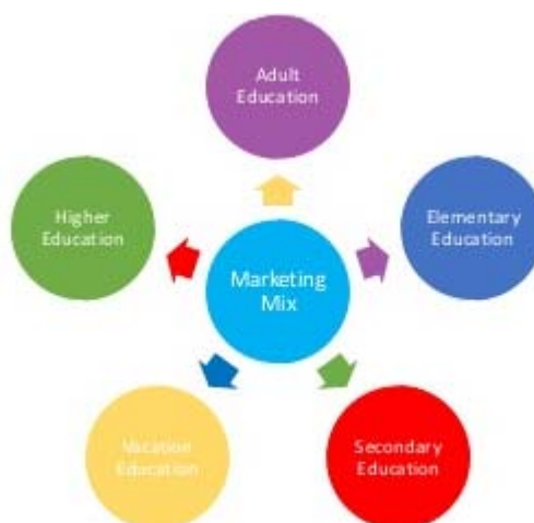
Figure no. 2. Educational marketing mix Source: Kondwani B.J. Manda (2014)

According to a more recent definition, the social marketing is a process that applies the principles and techniques of marketing to create communication and deliver value, in order to influence the audience target behaviour for the benefits of