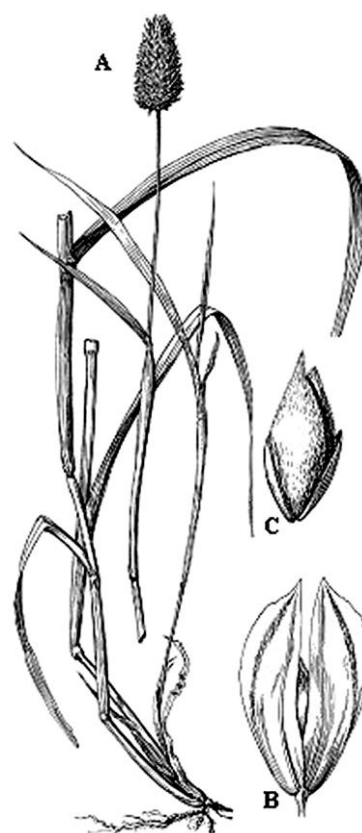
Figure 1. Illustration of canaryseed plant. References: (A) panicle; (B) spikelet; and (C) hairy hulled grain. Source: USDA-NRCS PLANTS Database.

Yagüez (2002) mentioned that in small amounts, canarygrass grains have been used to produce sizing for cloth or distillates for alcoholic beverage production.