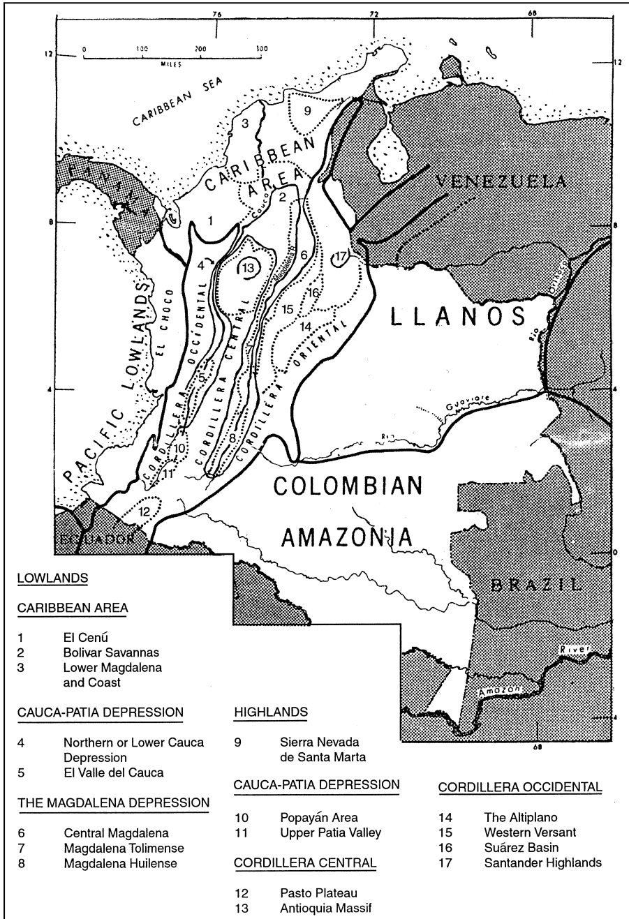
Map. I. Natural regions of Colombia.