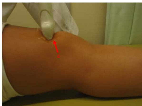
Figure 2 Transverse plane with the echo probe in contact with the proximal aspect of the patella.

(a) Synovial membrane thickness. (b) Perpendicular line of the central femoral bone. (c) Cartilage surface. (d) Synovial surface. (e) Proximal aspect of the patella.