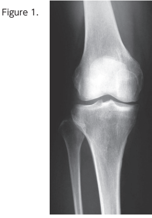
Preoperative radiography of the right knee joint in the anteroposterior plane shows medial joint space narrowing with no obvious osteophyte.

shaver and arthroscopic scissors. No abnormal findings were encountered other than the meniscal injury. Intra-articular decompression such as joint capsule rupture was not observed during the surgery.