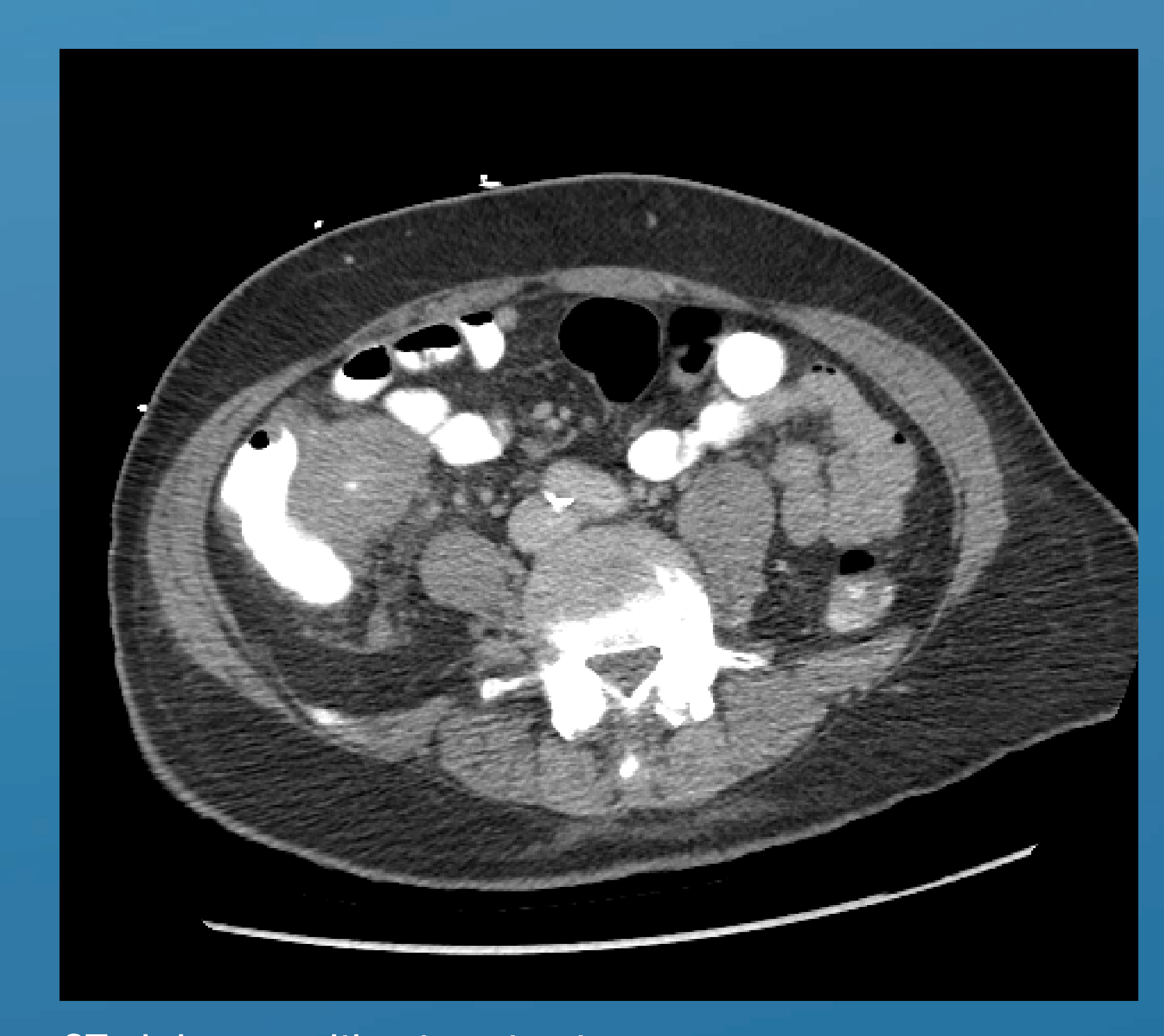
CT abdomen without contrast

Though less common in developed countries and the US, abdominal mass is a known presentation of extrapulmonary TB, specifically involving the ileocolic region. Presentation is often nonspecific and overlaps with Crohn's and malignant symptoms. Biopsy is important as well as a thorough history for risk factors.