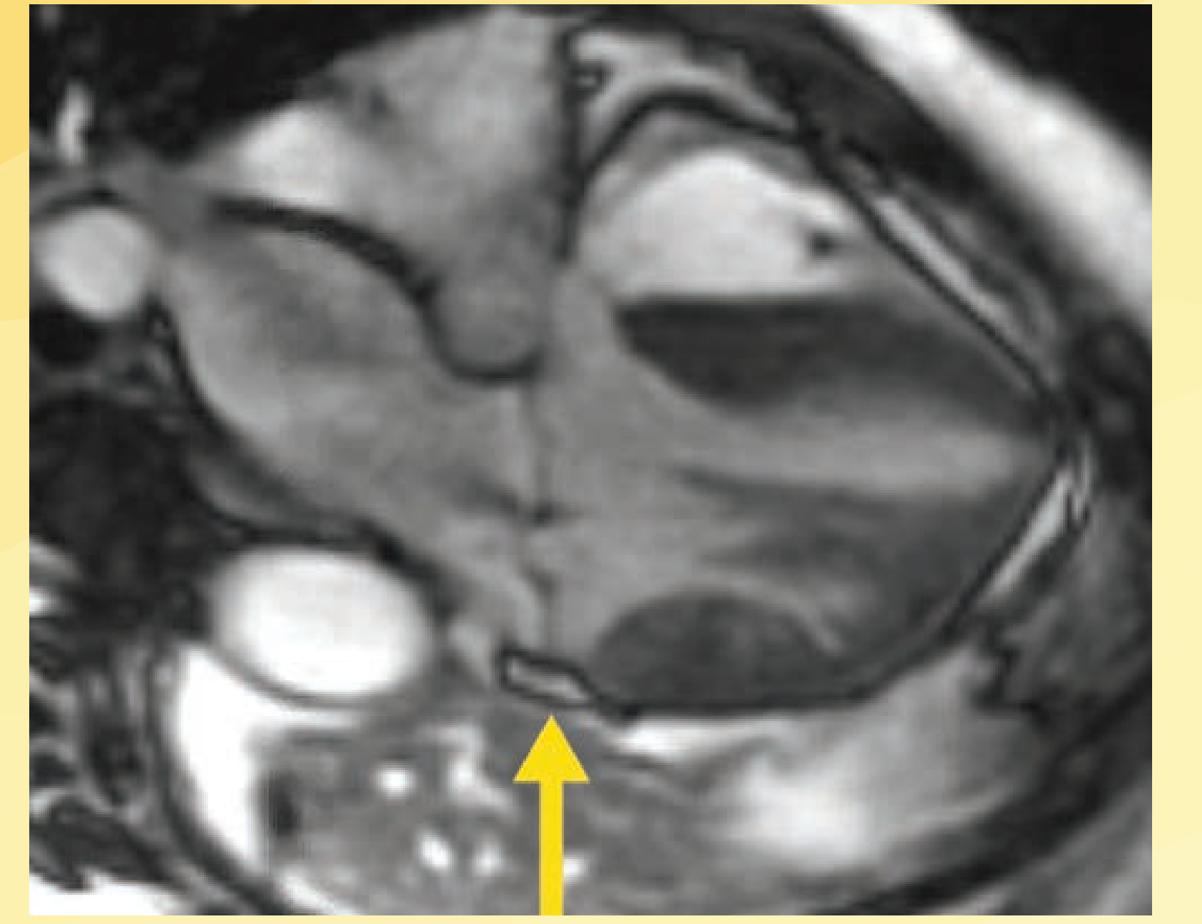
Figure 5: Mitral Annulus Disjunction on Cardiac MRI.