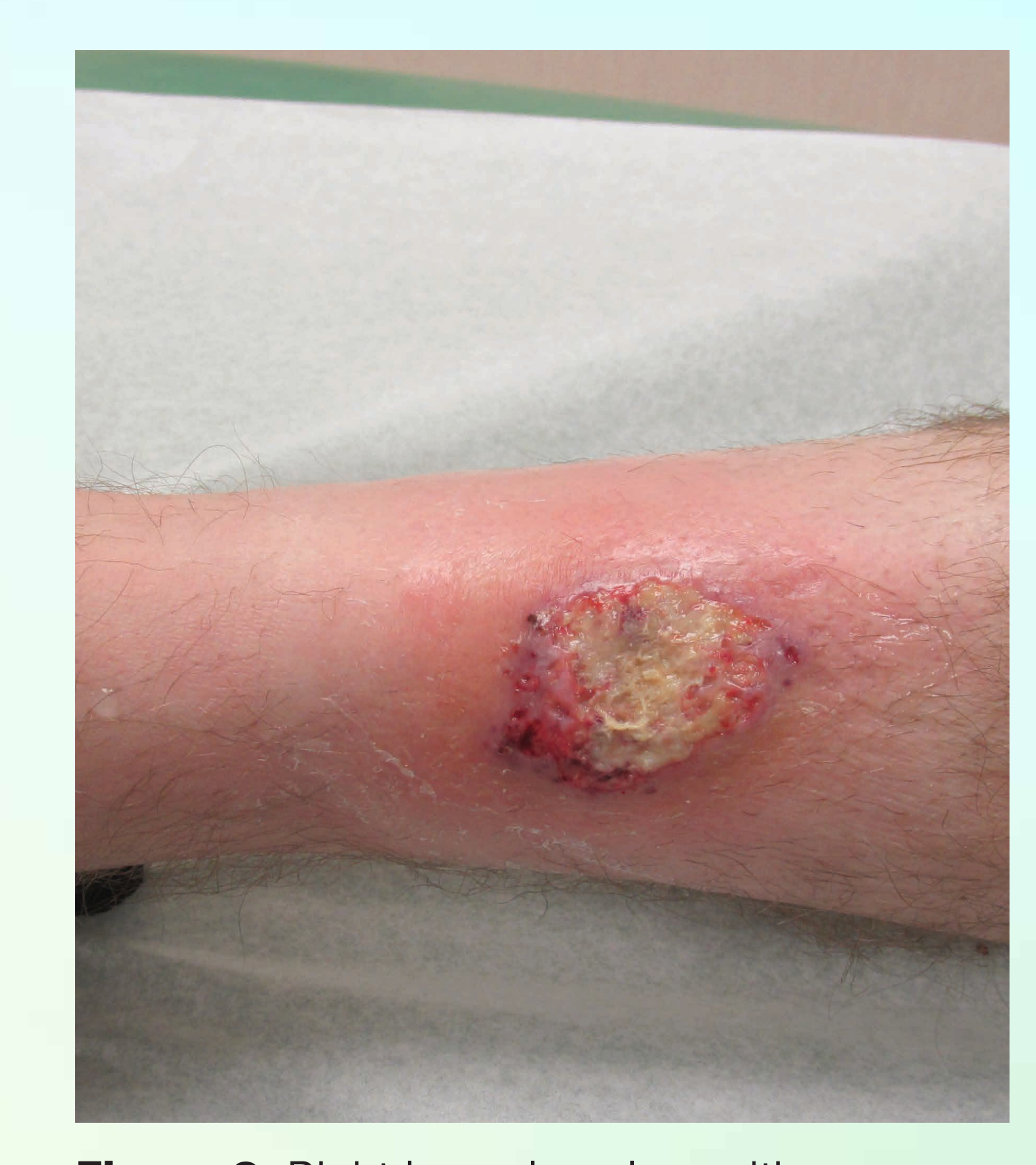
Figure 2: Right lower leg ulcer with a cribriform surface at the periphery, fibrin coat, violaceous border and erythematous halo. Consistent with pyoderma gangrenosum (PG).