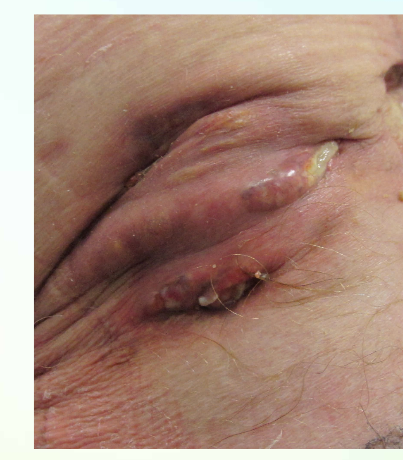
Figure 1: Right medial thigh with chronic draining fistulas following right hip arthroplasty.

BIOPSY: Health Network Laboratories (S18-8148, 2/27/18) Right lower leg: "ulceration with dense, neutrophilic inflammation. A few blood vessels show patchy fibrinoid change, slight fibroplasia and mural thickening and focal neutrophilic inflammation. PAS, GMS, Fite stains negative."