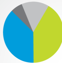
Pediatrics or subspecialty