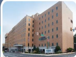
LVH-17 th Street