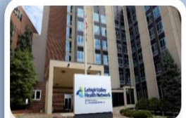
LVH-Schuylkill S. Jackson St.