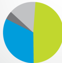
Family Medicine or subspecialty