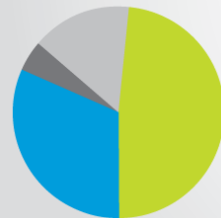
Emergency Medicine or subspecialty