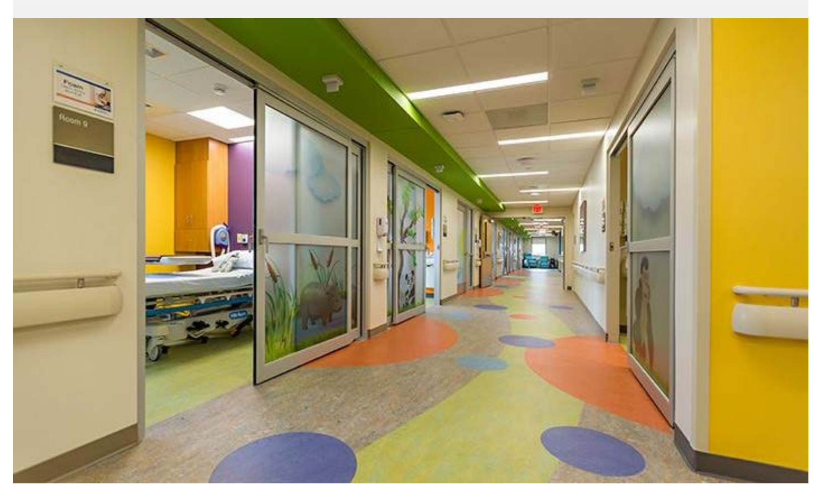
The Children's Surgery Center includes 16 private pre-/postoperative rooms, four operating rooms, two procedure rooms and a nine-bay postanesthesia care unit. The center also features a reception and waiting area designed specifically for children and families, a play area located in the preoperative area, and private consultation rooms.