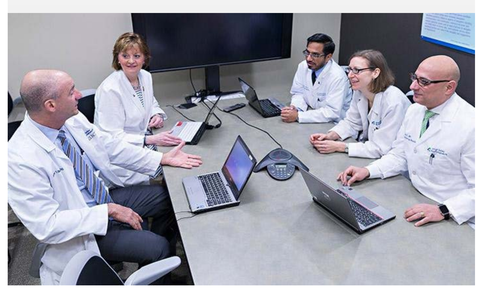
The multidisciplinary clinic allows everyone involved in GI oncology to discuss a case face-to-face, ask and answer questions, and reach a consensus on the best course of treatment.