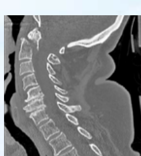
CT Scan showing C2 Fracture