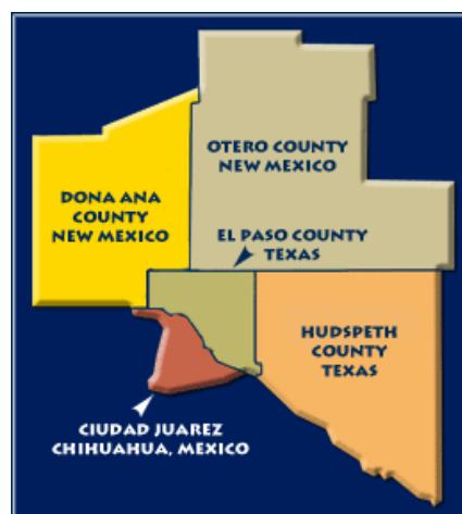
Figure 3 Paso Del Norte Region ( http://www.pdnhf.org/who_we_serve.asp )

The U.S.-Mexico border covers an area of 2,000 miles, spanning four U.S. and six Mexican states, 48 U.S. and 80 Mexican “municipios,” or counties, and extends 100 kilometers (62 miles) from the international boundary, both north into the United States and south into Mexico (Bureau of Primary Health Care, n.d.). Up from six million in 1970, the US-Mexico border area currently has a combined population of approximately 13 million (U.S.-Mexico Border Health Commission, 2003), and is projected to double by the year 2020 (Homedes & Ugalde, 2003). Figure 3 illustrates the Paso del Norte border region.