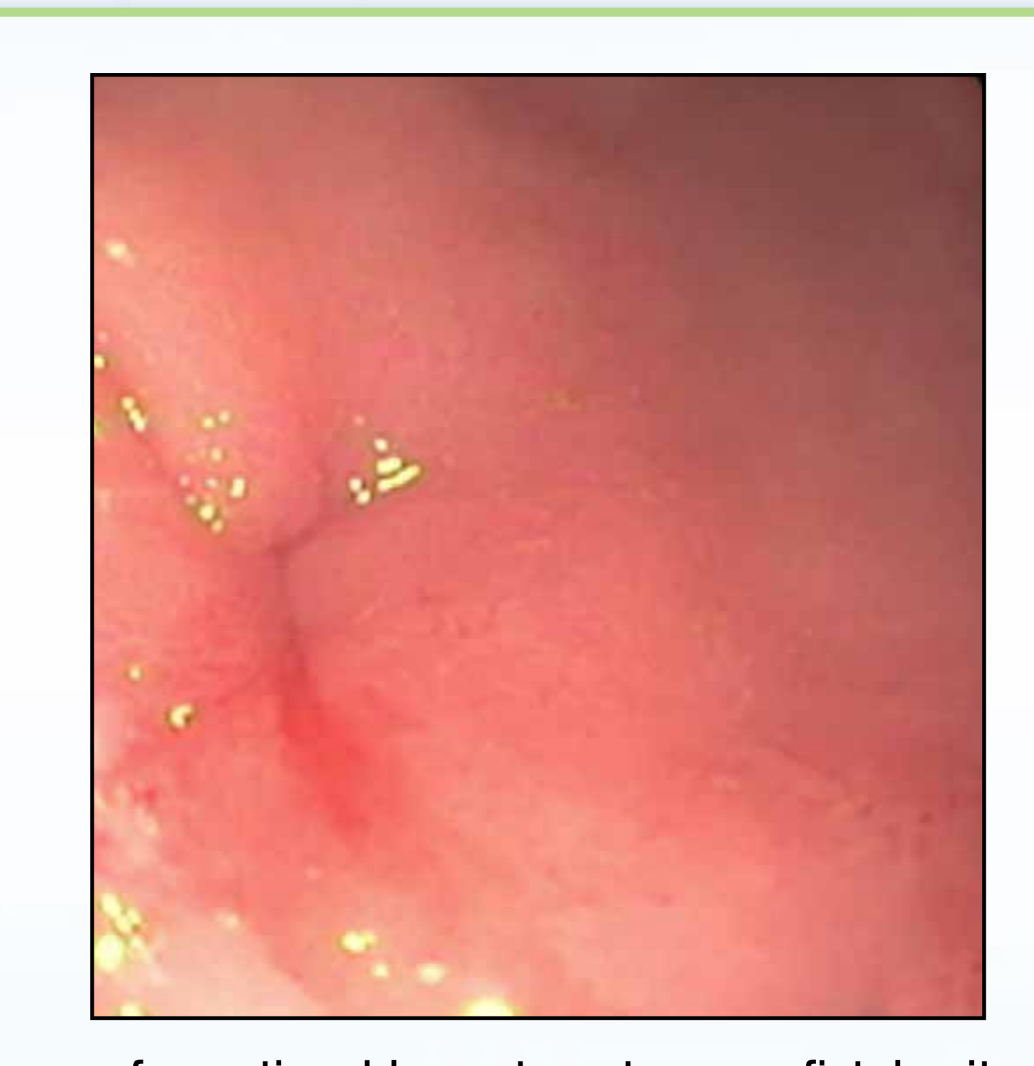
Figure 1: Appearance of questionable gastrocutaneous fistula site within gastric antrum.