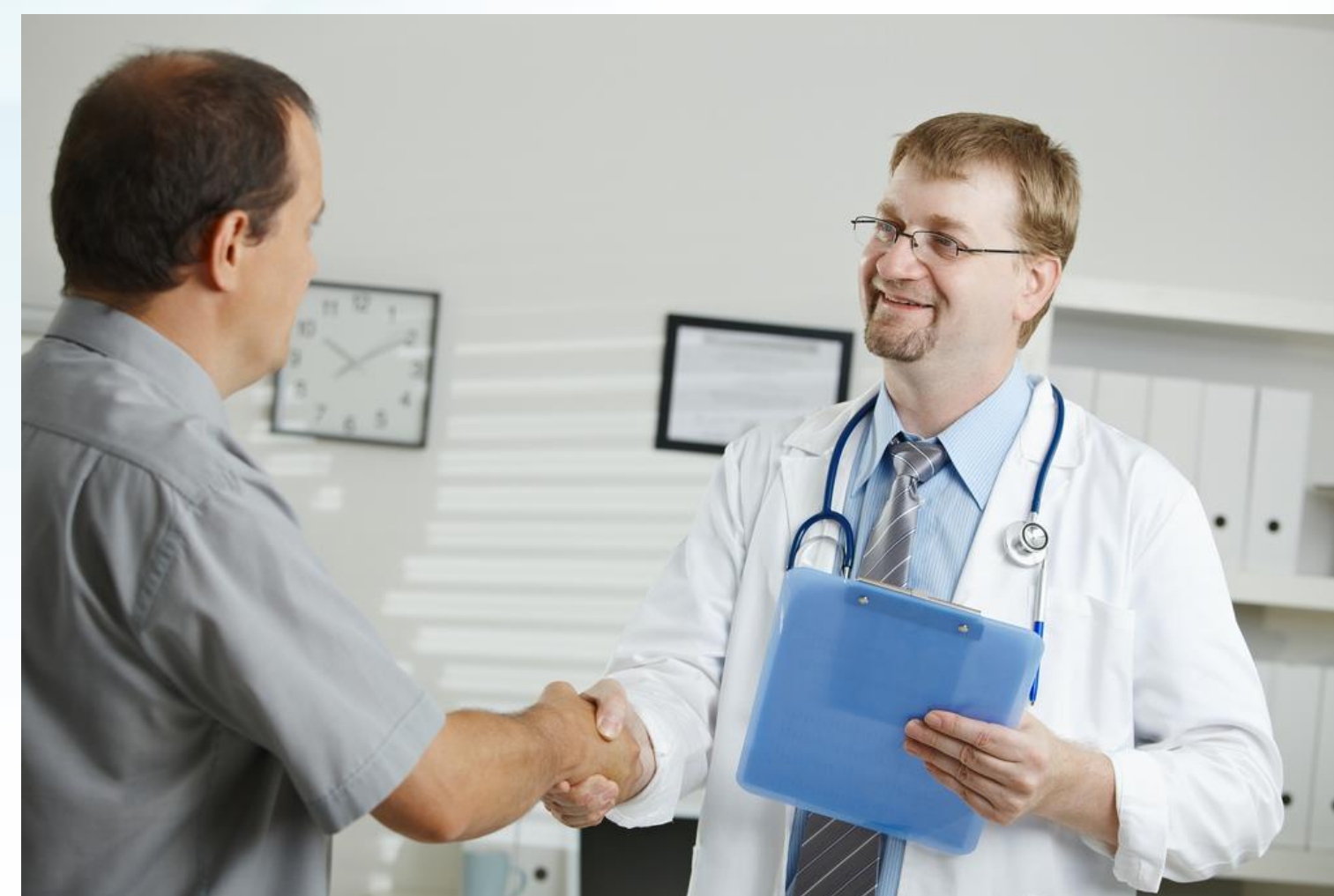
Meeting assigned physician and nursing team

Registration and breakfast ↓ OR tour and scrub training