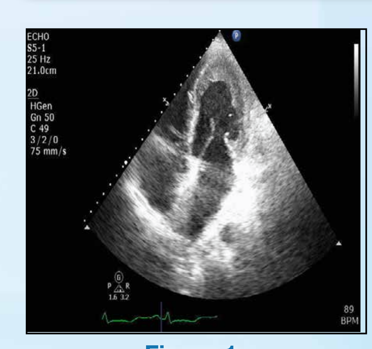
ECHO $5-1 25 Hz 21.0cm 2D HGen Gn 50 C 49 3/2/0 75 mm/s