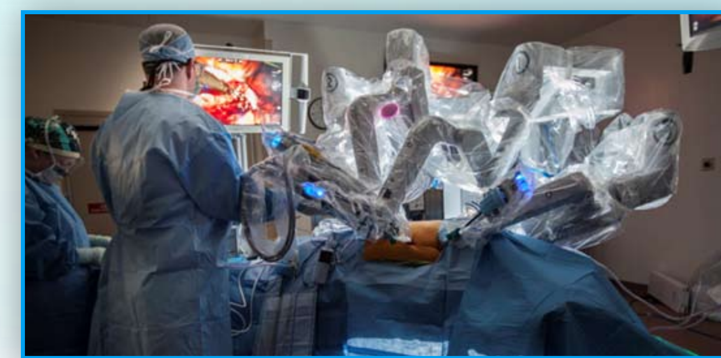
Using the robotic Da Vinci robotic platform during thoracic surgery.