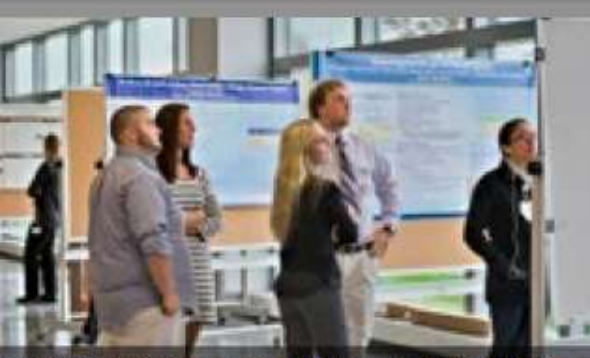
Visitors review posters at Research Day 2013