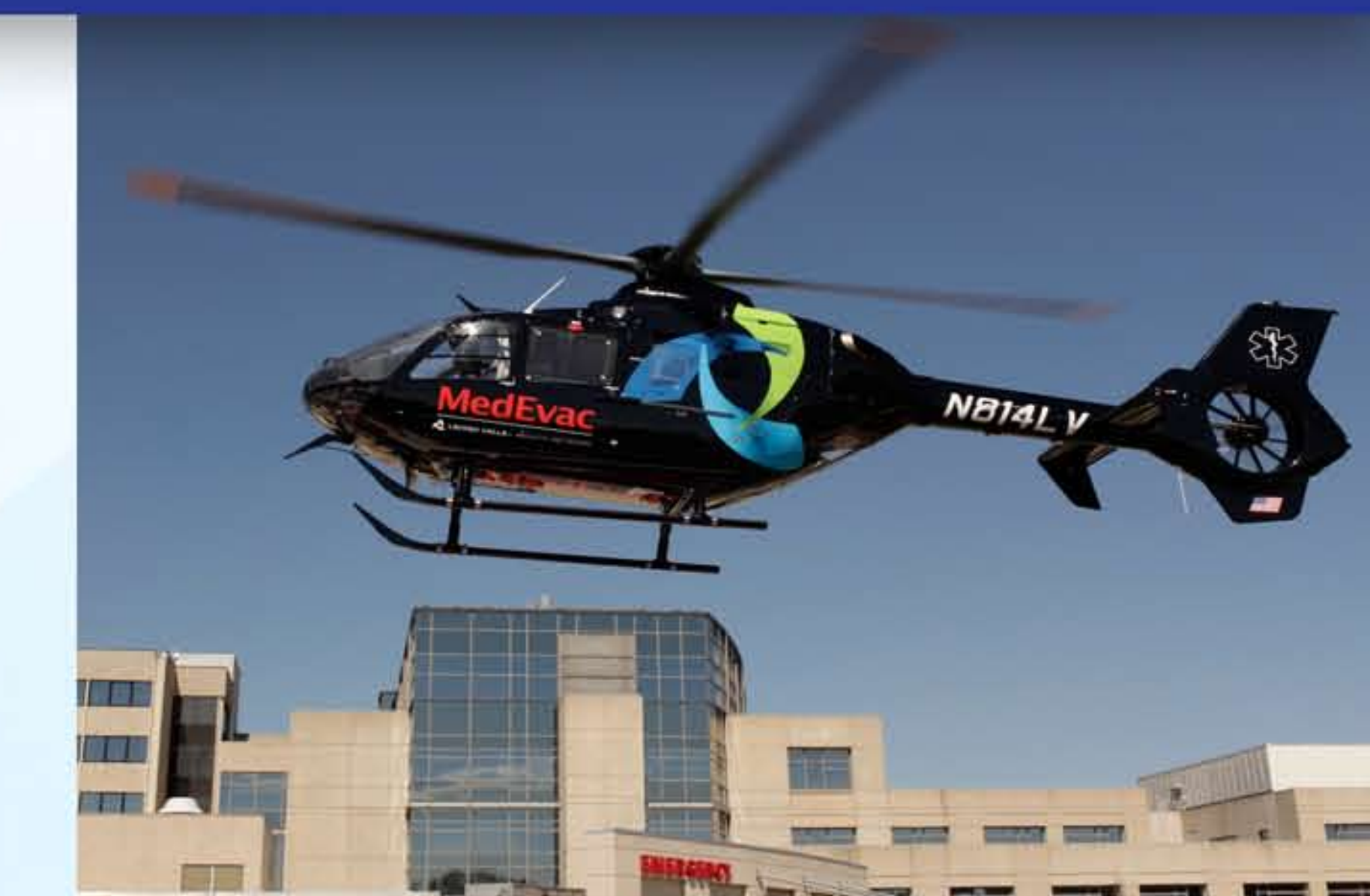
Image 2. Orientation Day Evaluation