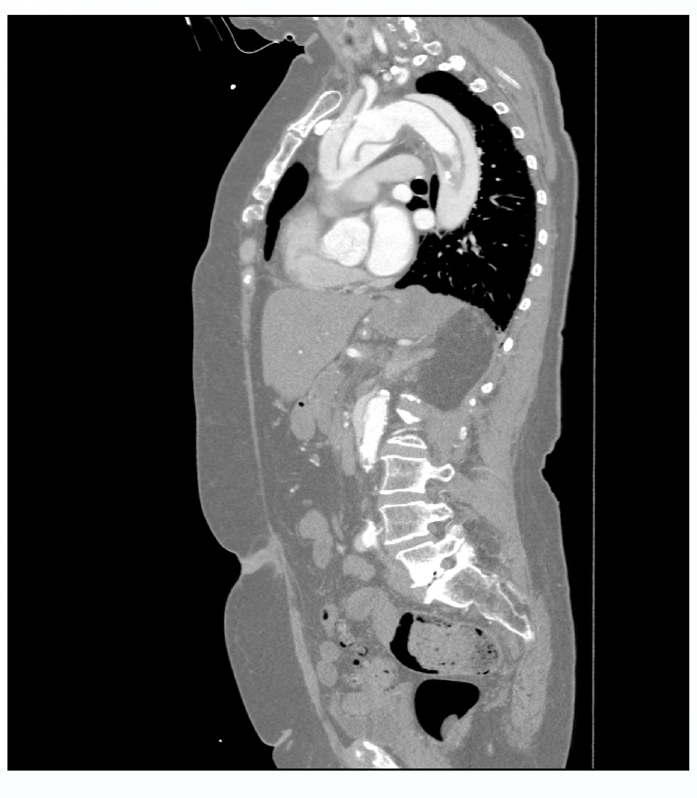
Type A dissection 2