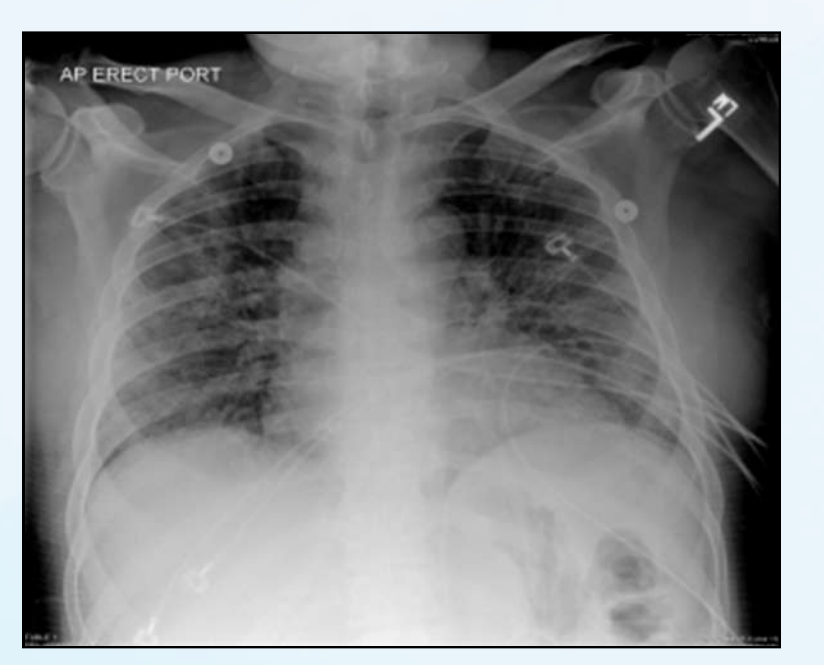
CXR prior to discharge