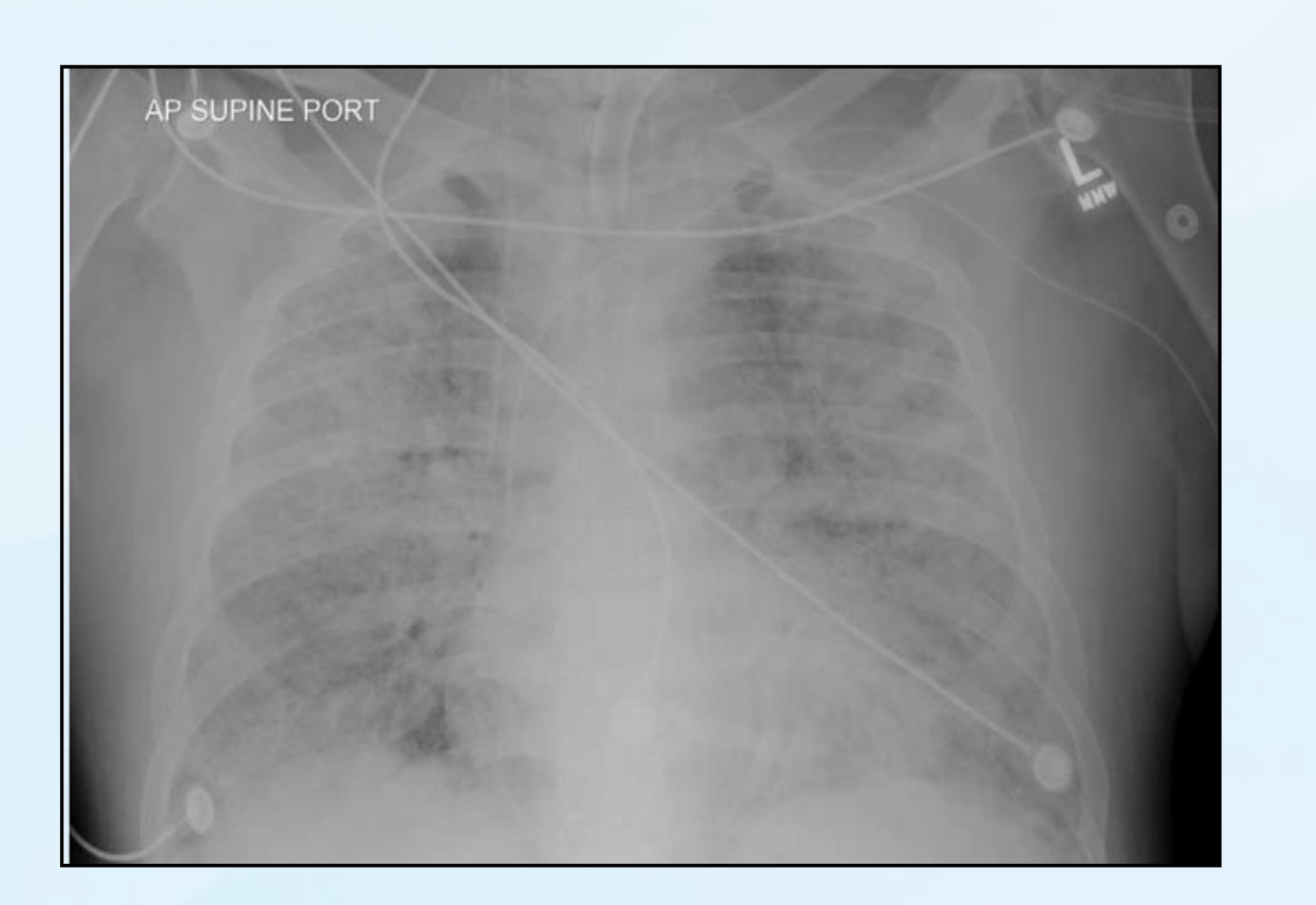
CXR prior to second ECMO