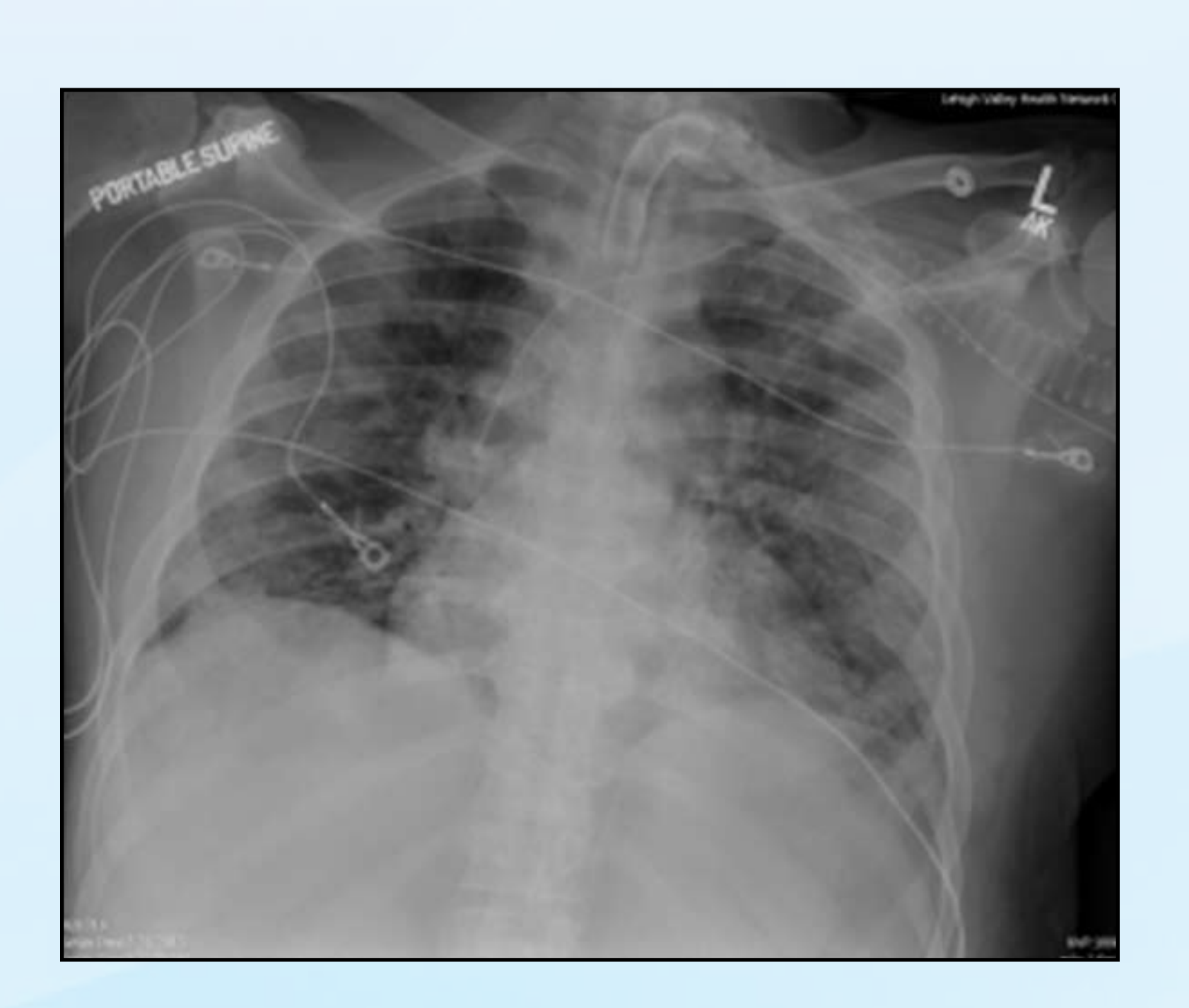
First de-cannulation CXR