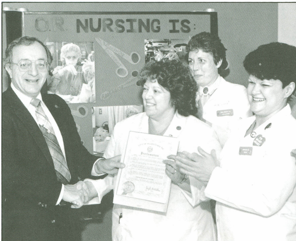
Allentown Mayor Joseph Daddona presents a proclamation announcing Operating Room Nurses Day, Nov. 14, to Operating Room nurses at TAH site.