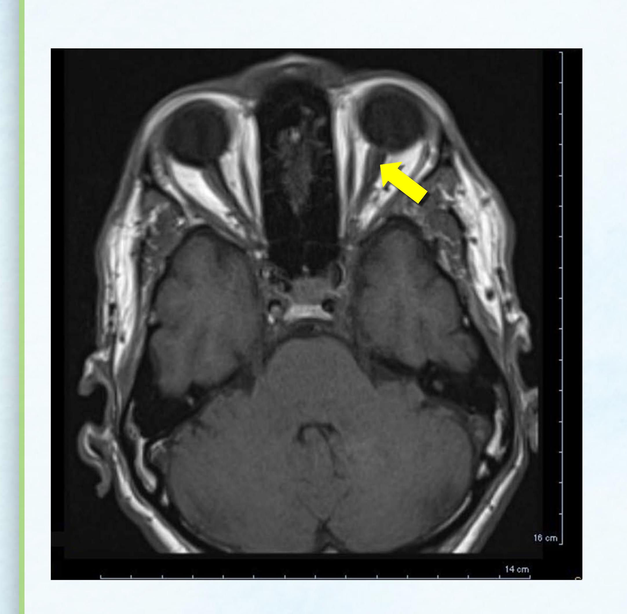
Figure 1: Enhanced optic nerve on T2 weighted MRI image ( Pre-treatment)

The patient was started on HAART, TMP/SMX and folinic acid and clinically improved. Re-imaging showed decreased enhancement of the optic nerve.