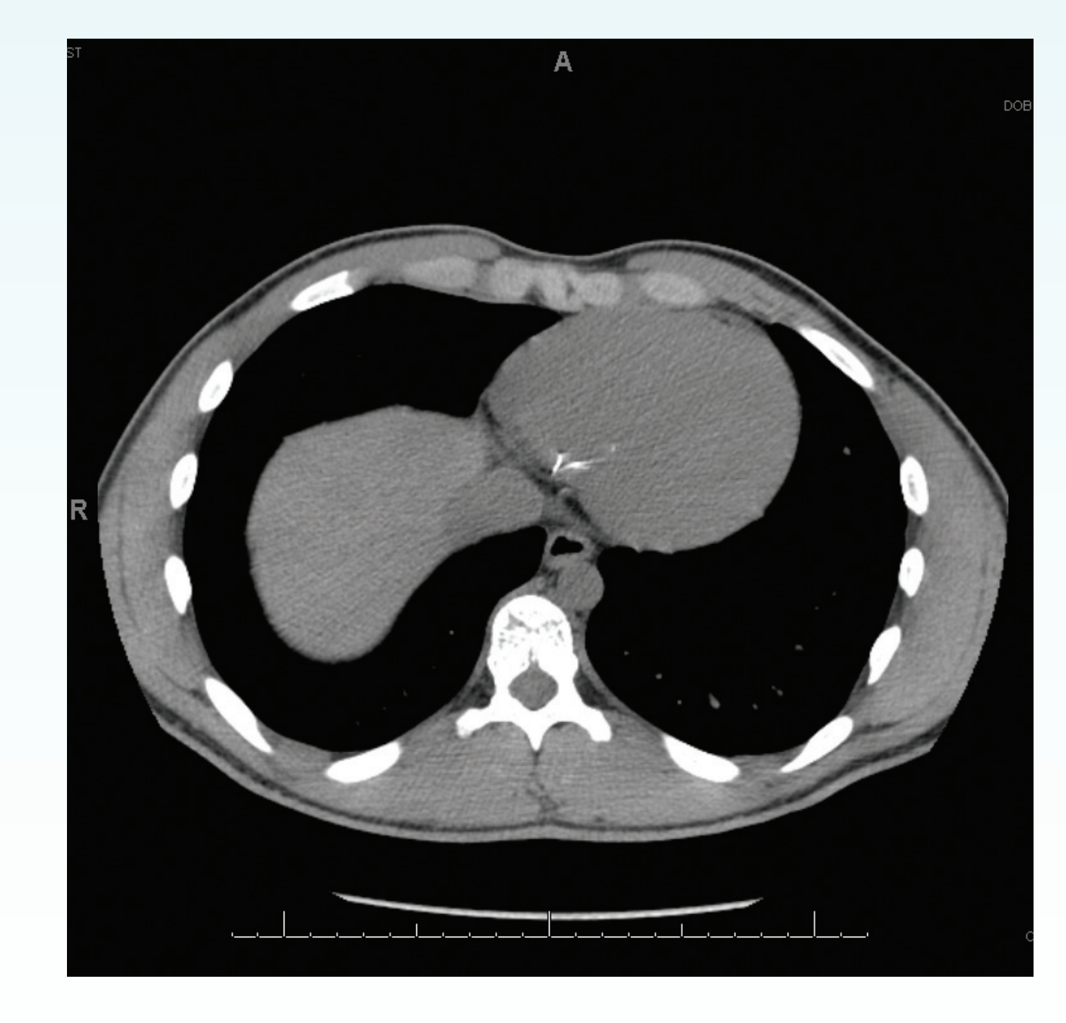
Figure 2. CT scan of the chest with centering strut visualized in right atria 9/17/09

Figure 3. CT scan of the chest with centering strut visualized in right atria 1/29/10