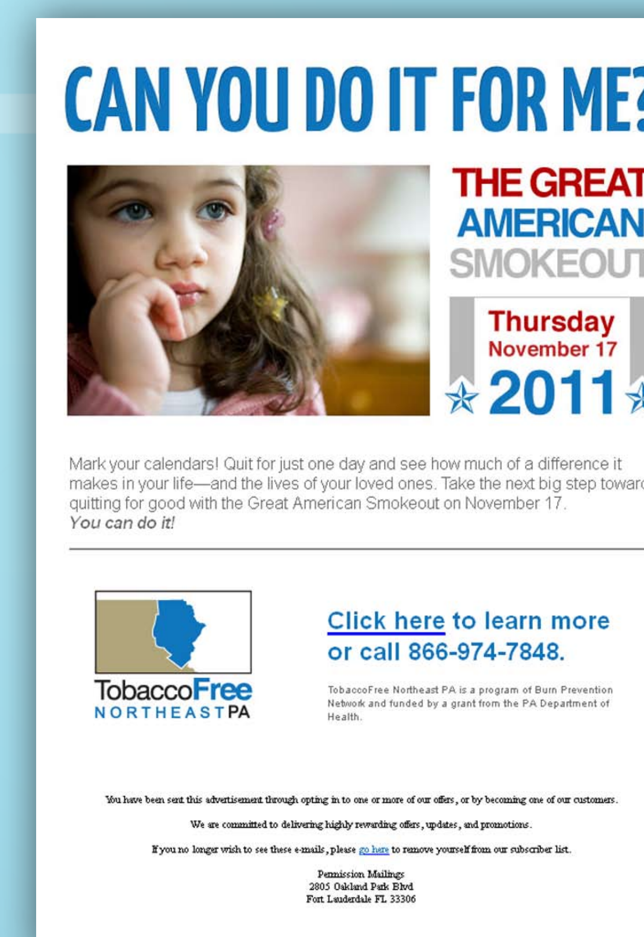
Can You Do It For Me Email Blast November 2011