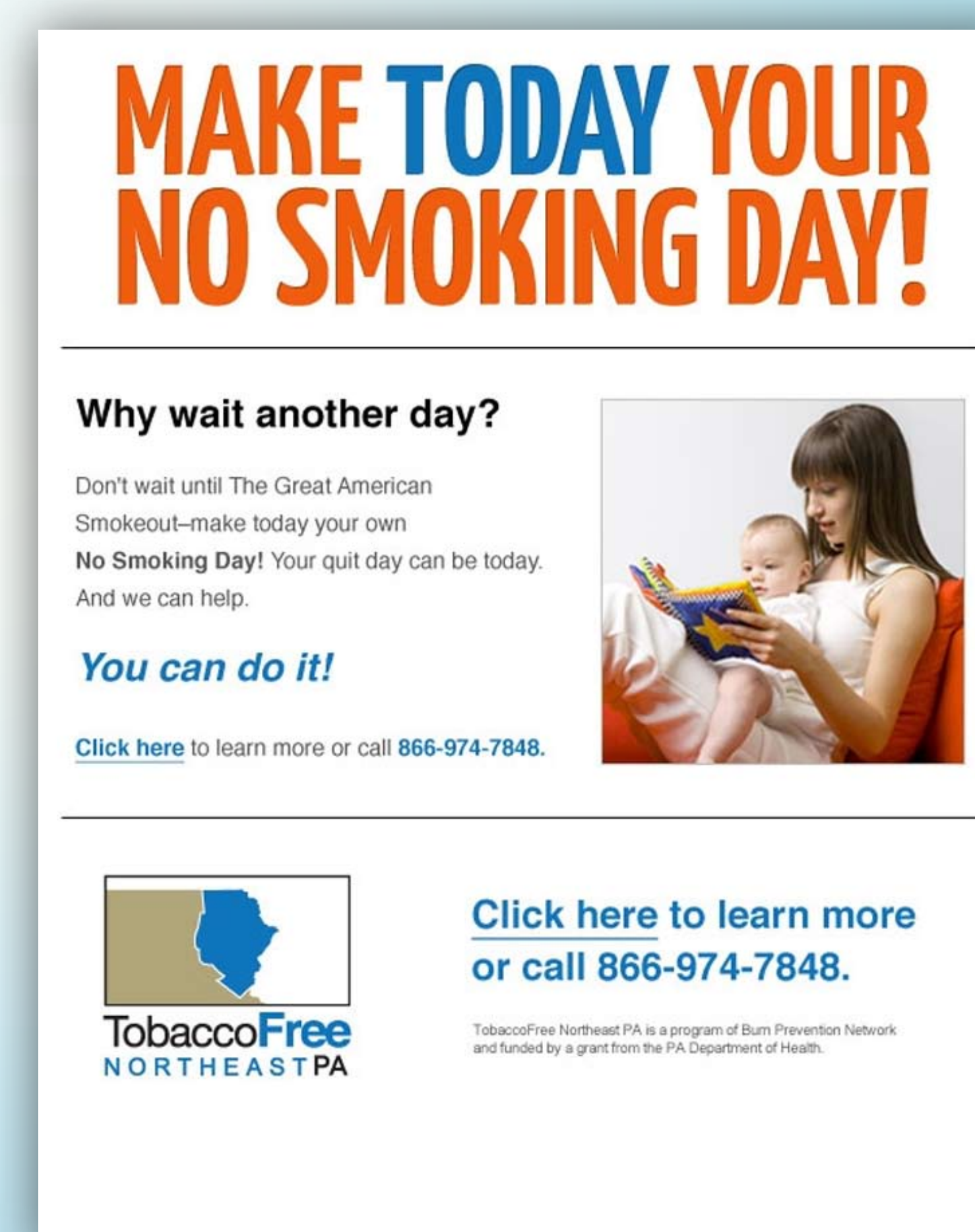
Make Today Your Day Email Blast October 2011