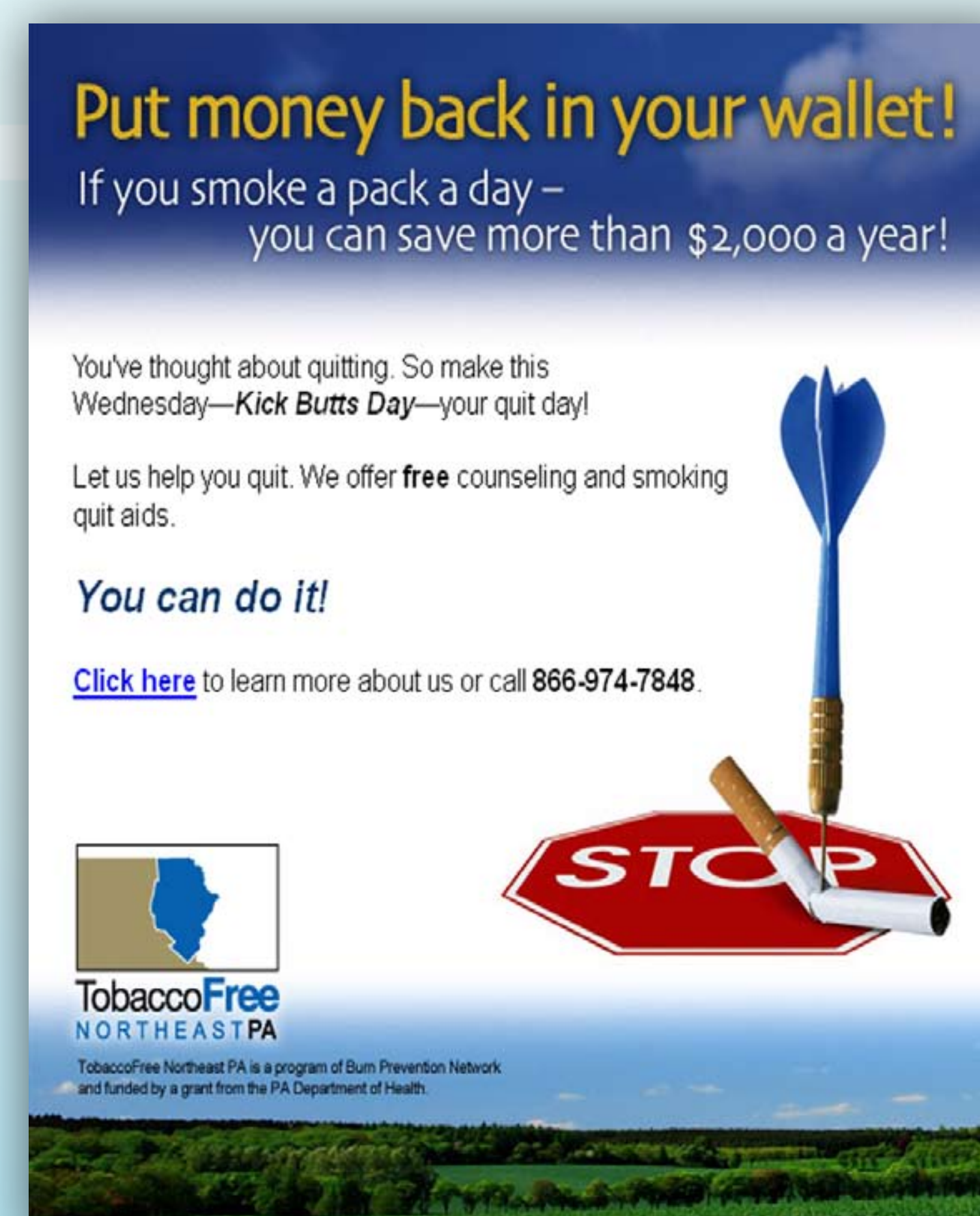
Quit Smoking Email Blasy March 2011

As the ads became more powerfully directed to a segment of the population, we realized increased activity in clicks and website traffic. At each blast, web hits doubled or tripled in volume and increasingly became a higher percentage of web traffic. Our cessation providers saw a 44% increase in tobacco client enrollment in FY 2012, in part due to this low cost and direct marketing strategy.