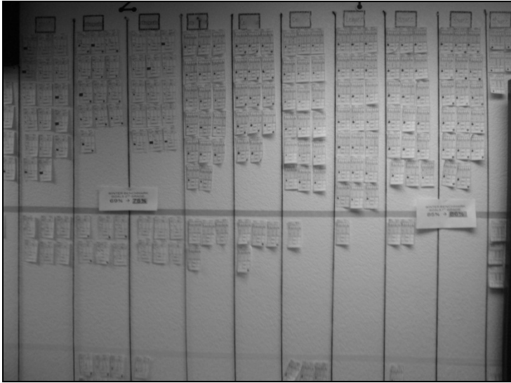
Figure 2. The data wall.

These data walls used distinctive characteristics of the material world to organize symbolic displays of quality (Goodwin, 1994). Figure 2 shows how these walls were divided into columns and rows. Each column represented a classroom, while each row represented the classification schemata of the DIBELS, i.e., intensive, strategic and at-benchmark. Each piece of paper on the wall represented a student and his/her DIBELS scores over time. Individual pieces of paper were moved up or down the rows of the data wall as DIBELS scores changed. The arrangement of these pieces of paper conveyed a judgment about each teacher's quality. A single rapid scan through the data wall informed viewers about those students were not meeting benchmarks and their corresponding teachers. Trina, the language coach, elaborated on data wall meetings: