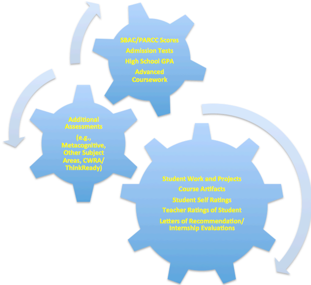
Figure 3. Example of potential data in a multi-dimensional student profile

Subordinate levels of the profile would contain additional information including actual student work with insights into the techniques and strategies they used to generate the work. Student work would be sorted and categorized through the use of metadata tags to array it by characteristic that would make it easy and convenient for a reviewer to pull up samples based on areas of interest, such as interpretive thinking or research or mathematical reasoning.