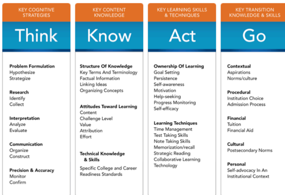
Figure 1. Four Keys Model