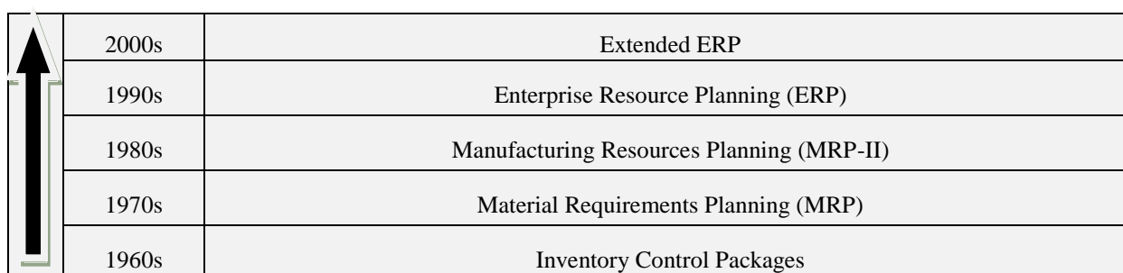
Figure 1. Evolution of ERP