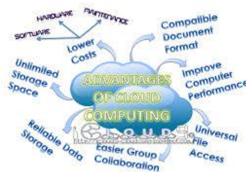
Figure 4: (advantage of e_accounting using cloud computing)

8- Deliver new services. It makes possible new classes of applications and deliveries of new services that are interactive in nature.