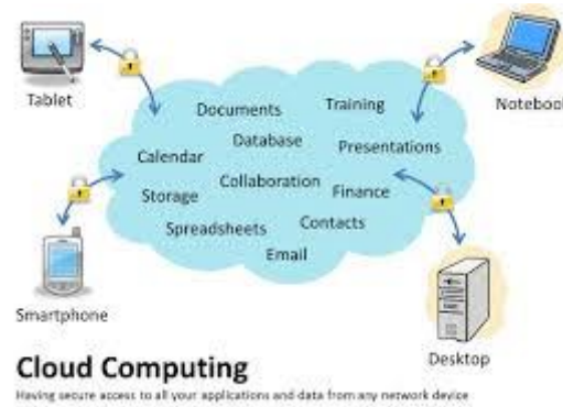
Figure 2: Finance(e_accounting with cloud computing)

delivery and the consumer utilization model. In the background, service provider's uses particular technologies, system architecture, design and industry best practices to provide and support the delivery of service-oriented, elastically scalable environment serving multiple customers. This helps end users to have more agile and flexible service oriented architecture for their application and services. In a conventional IT scenario, most software companies have procured different components of their application middleware infrastructure layer from various vendors, and brought together these tools into a corporate environment using system integration services and tools. On the other hand, in a Cloud computing scenario, this practice is quite rare. Platform-as-a-Service solutions provide environment and applications development platforms for seamlessly integrating Cloud computing into existing application, services, and infrastructure with a market-oriented approach.