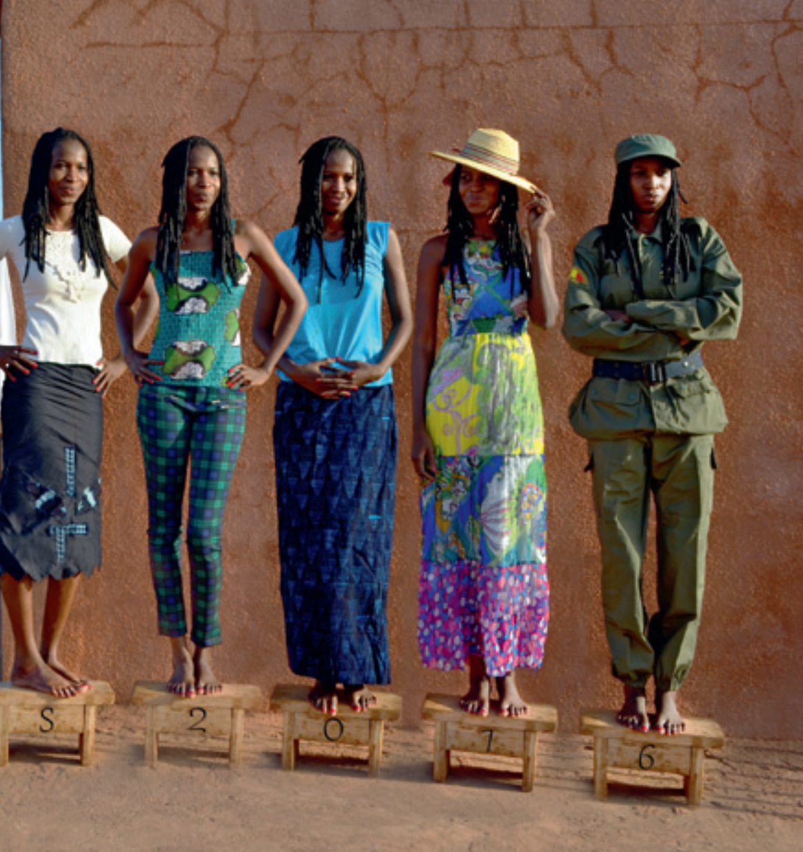
Fig. 5: '9 Sisters'. Dicko Traoré 2016, courtesy of the artist.

another female identity. All nine women stand on small wooden stools that are usually used in the kitchen while cooking. Wittily, these small chairs associated with the conventional female realm of domestic work are transformed into pedestals on which the '9 sisters' stand, proudly elevated, presenting themselves. Metaphorically speaking, they are emancipated from the idea that women are restricted to the realm of domestic work. They now consider for themselves a variety of possible life plans. Traoré told me 10 that the dominant discourse in Malian society remains that women should be submissive, modest, and courteous, above all. With this picture she wanted to glorify women inviting the broader society to look at them differently and show them more respect.