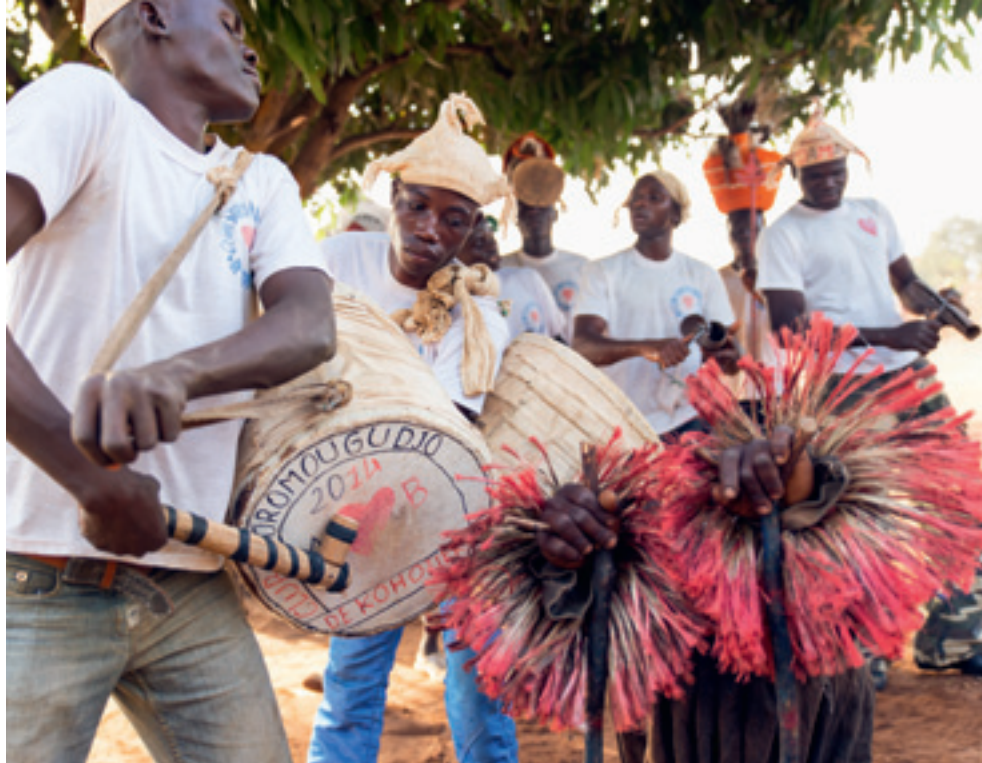
Fig. 9: The musicians of a solo mugu jo ensemble walking around a kneeling mask. The lead drummer accelerates the beat and thus stimulates the mask to perform. The drumhead displays the name of the group, its home town and the year when the current equipment was acquired. Korhogo, February 2015.