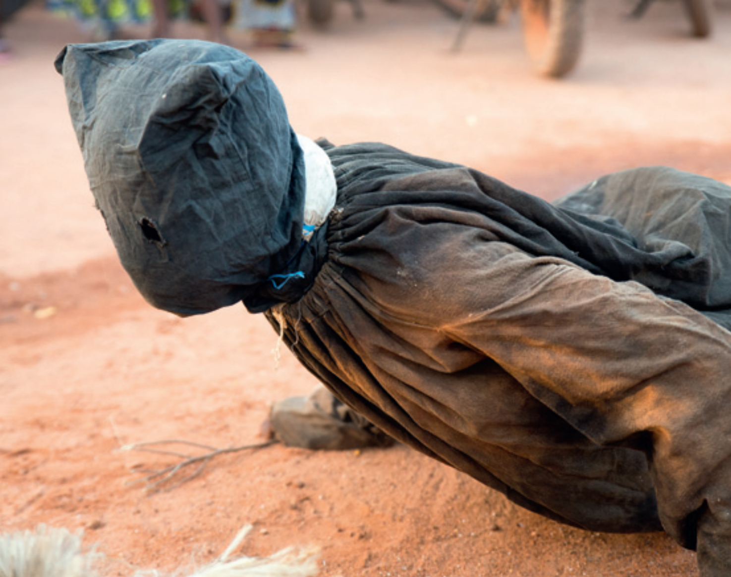
Fig. 10: A kodáli mask creeps over the ground after having performed its acrobatic flic-flacks at a wedding. Korhogo, November 2013. Till Förster.

down so that the figure is at eye level of those who are attending the performance from chairs in the front row. Such movements are often much slower than the walking. On such moments, bystanders and later, when the performer is closer to the audience sitting on chairs and benches, can watch the sculptural features of the figure and how finely it is carved.