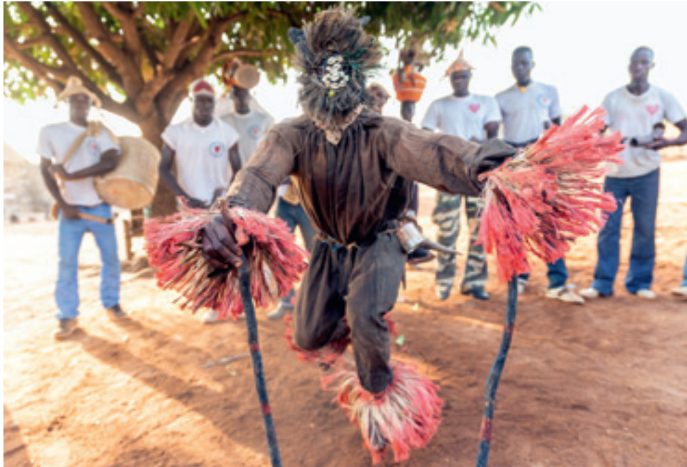
Fig. 12: A kodáli mask presents itself to the audience by jumping up. Korhogo, February 2015. Till Förster.

creates or confirms a patron–client relationship and situates the event in the social web of urban politics. Other performative acts can lead to the same outcome. The musicians may pull somebody on the dance floor and accelerate the beat to make him dance faster.