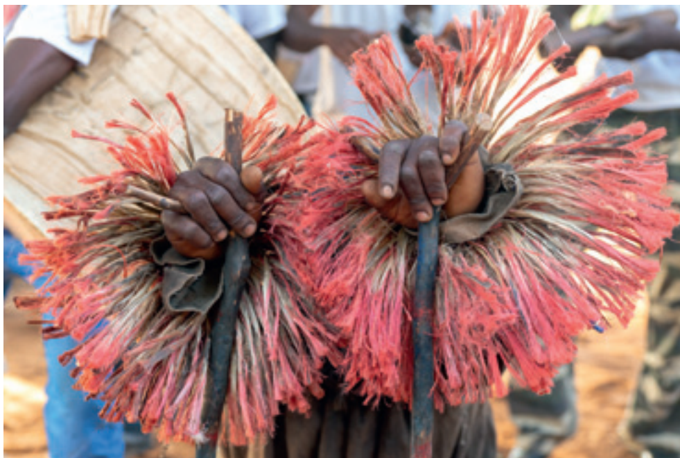
Fig. 11: The beginning of the performance: The dancer kneels down in front of the audience and hides his head behind his hands and the raffia bundles at his wrists. Korhogo, February 2015.

In the sound carpet of the massive percussion, the occasional shouting of the musicians is interwoven with exciting moves of the masked dancer. He may turn his back towards an elder and eventually seat himself on his lap, freezing his movements for a moment. Being honoured as a patron links past and present. On the one side, the elder may have contributed to the group by providing money or some material that they needed, for instance, the cloth for the costumes, the musical instruments or the guidance that they needed in a difficult situation. On the other side, the group may prompt somebody in the audience to donate a few coins or even a bill to the group if they believe that the man could be willing to do so. How much the person gives does not only depend on his means but also on his ambitions to inscribe himself in the social and political space that kà pã cǎŋ relates to. Seating oneself on the lap of an elder in the audience thus