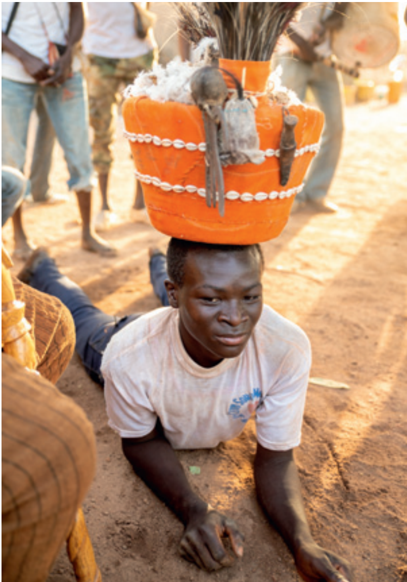
Fig. 1: The carrier of the kà pã cãŋ basket creeps over the ground in front of elders. Korhogo, February 2015. Till Förster.

Unsurprisingly, articulation is also a key term of discourse theory. In an emerging discursive formation, actors may change their position and engage in new roles according to articulatory necessities instigated by the ongoing interactions between them. Spectators may thus take the role of active performers while others may turn into spectators when the former take the lead. Very much as producer and spectator, the strict division of stage and audience is not universal and cannot guide anthropological studies of the arts. Actors have to situate themselves in a field to adopt one or the other position by articulating their own convictions and claims in a convincing way – that is, in a way that shows their skills and creativity in making their claims heard. They may do so as actors on stage but also as actors in the audience. Their identities are situational and much more flexible than conventional studies of the arts believe. Instead of projecting the role models of the modern artworld on other social and cultural settings, it is more important to examine how the taking of positions is done, how aesthetics play into it, and how that leads to more or less stable configurations of actors.