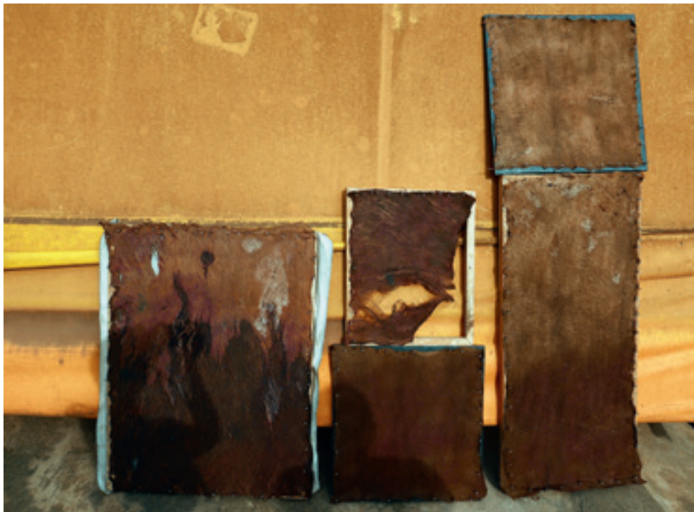
Fig. 11: Canvas experiments with barkcloth. Fiona Siegenthaler, August 2, 2017.