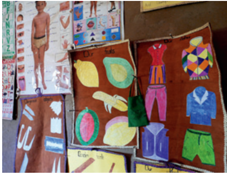
Fig. 9: Teaching material created from barkcloth at the school of Kibinge.