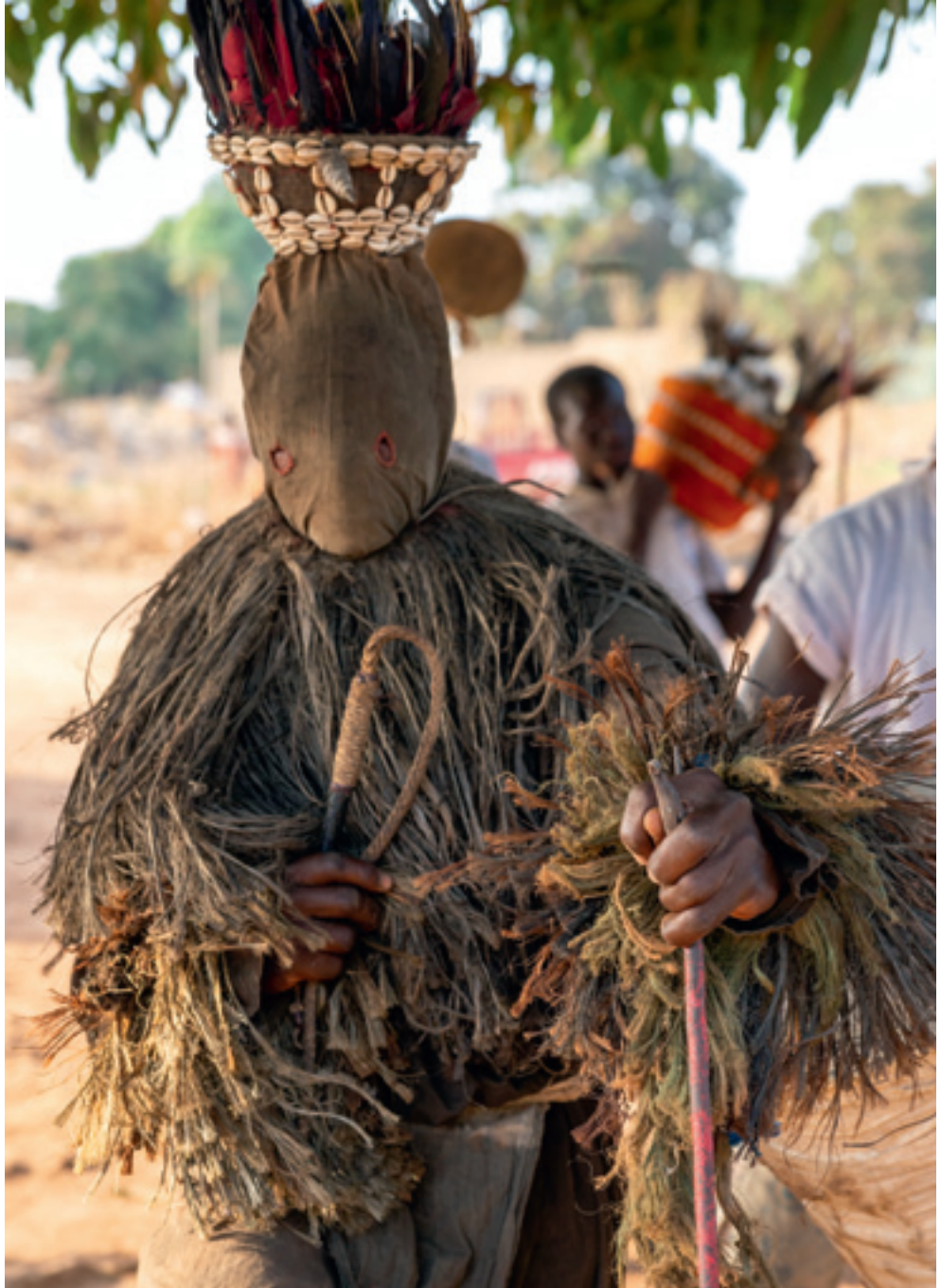
Fig. 3: "Dark One" approaches the audience, accompanied by musicians of the kà pā cǎŋ ensemble. Korhogo, February 2015. Till Förster.

Most of the time, first settlers and latecomers got on fairly well – also during the late 19 th century when villages began to grow faster than before and eventually became towns. No wonder that these emerging towns became the subject of cultural and social imagination – an imagination that was related to resistance, self-reliance and the social integration of people of different regional and cultural background. Korhogo was one of these emerging towns. By the end of the 19 th century, it had been a market town as many others in the region. The first census of the French administration, published on behalf of the 1903 colonial exhibition in Marseille, counted a little more than 2000 inhabitants. 3 That was a little more than the average of other bigger villages, but it was not exceptional. Unlike many other towns, however, Korhogo increasingly profited from two overlapping strands of the profound historical transformations that rocked West Africa at the time.