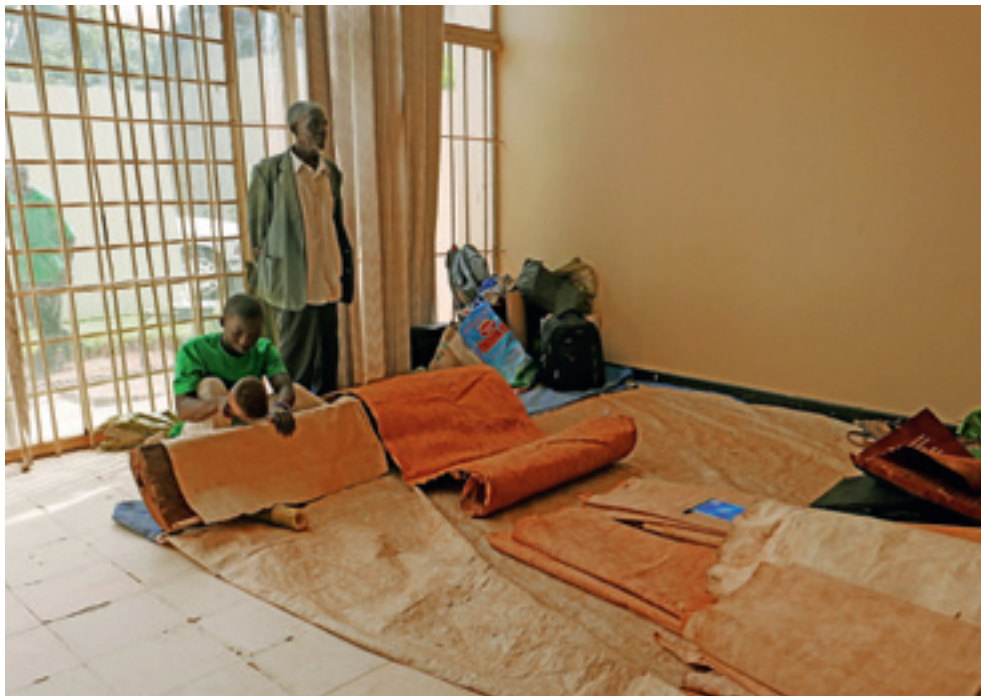
Fig. 2: Bakomazi from BOTFA presenting their craftsmanship at the Uganda Museum, Kampala, in occasion of Bark to the Roots 2 . Fiona Siegenthaler, October 14, 2016.

Such events help to promote barkcloth as a contemporary asset. They reposition barkcloth as a modern product that relies on a long and proven tradition and simultaneously promote its potential for creative exploration and economic investment in a growing national economy. Moreover, the barkcloth market is particularly interesting for the Buganda Kingdom. Because its re-instatement was bound to the condition that it does not assume political functions but exclusively 'cultural' ones, the Kingdom cannot collect tax or other revenues from its subjects and hence must support itself in other ways. 13 The markets related to cultural heritage therefore are of major significance for the kingdom and are reflected in the way it promotes barkcloth – the material most associated with its history and cultural importance. However, such promotion requires investment to an extent that Buganda cannot fulfil. It must rely on partners who recognise the economic potential of barkcloth, who identify with its tradition and who develop markets beyond Buganda. Mutebi's articulatory practice represents exactly such a mediating link.