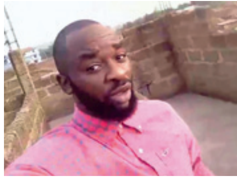
Fig. 3: Stills from the poet's performance on the rooftop, filmed by himself with a smartphone.

Baby rwak lepi wadhi ba e show Baby be iparo ka watugo 'by sho' I love you baby But I can't have you baby