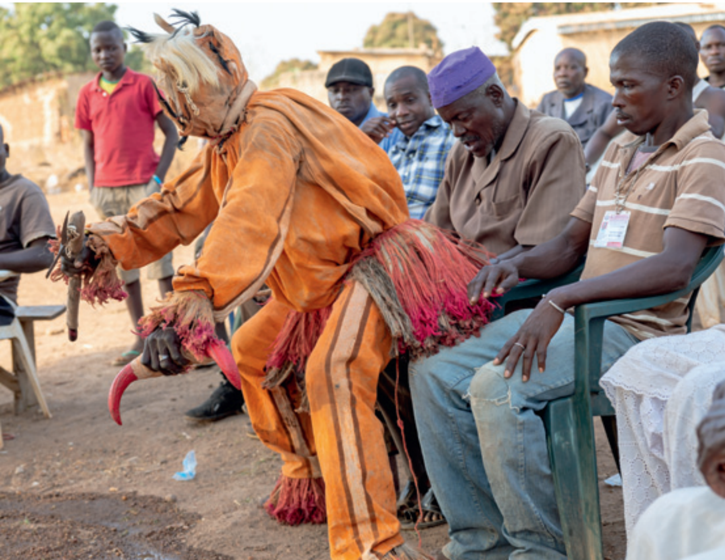
Fig. 13: A dancer seats himself on the lap of an elder who is a patron of the ensemble. Korhogo, February 2015. Till Förster.

There is a dark side to kà pā cǎŋ and solo mugu jo . It is less visible when a club performs at a wedding, but surfaces time and again on occasions related to urban politics such as funerals of high-ranking members of the dominant clan of the Coulibaly, its branches and allies. Some ensembles have a mask that is entirely dressed in dark, almost black cotton. It carries an iron trident and has a small basket on its head, decorated with black and red feathers. Its performance resembles that of the other masks – with a notable exception. Its dance is not as fast as that of the other masks but also not as slow as the pacing of the men who carry the figurine and the basket. Called “the Dark One” (fig. 3), its movements seem to be informed by invisible things that the audience does not perceive. The mask may suddenly turn its head to the side where, it seems, something attracts his attention – something that ordinary people do not see. Those who are not familiar with its performance may suspect that the mask is irritated or that somebody has done something ‘wrong’ and provoked its reaction. And when the mask gets up, it may suddenly turn towards another place, approaching a person that was neither in its way nor in that of the musicians who try to form a semi-circle behind the masked dancer. No movement is predictable, and neither is what the masks will do.