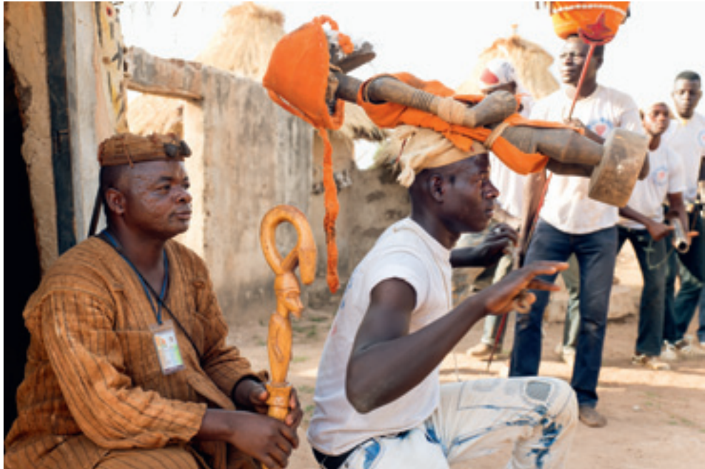
Fig. 7: A kà pā cǎŋ ensemble greets the owner of the ceremony (left). The figure carried horizontally on the head is balanced as carefully as the basket but the movements of the man who performs with it are much faster, and through his movements, he also interacts with the audience. Korhogo, February 2015. Till Förster.

had been in use since at least the beginning of the 20 th century. The Senari speaking people of Korhogo see it as a part of their cultural heritage and by the same token as a powerful “fetish” 11 that is as active and effective until the present day. The basket contains numerous power objects as bones and horns of sacrificial animals, smaller baskets that contain cowry shells which are also used as divination objects, money and dice. The basket also contains a bundle or sometimes two of feathers and porcupine spines wrapped in leather or some vegetal ribbon. The entire basket is wrapped in a fabric and often covered by sacrificial blood and hence black with a few red traces (see fig. 4,6).