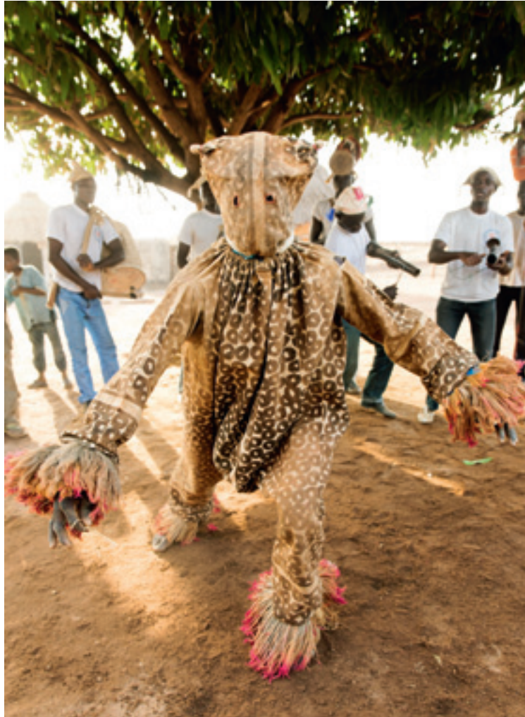
Fig. 16: A kodáli mask performs in front of the musicians. Its dance is as fast and acrobatic as possible. Korhogo, February 2015. Till Förster.