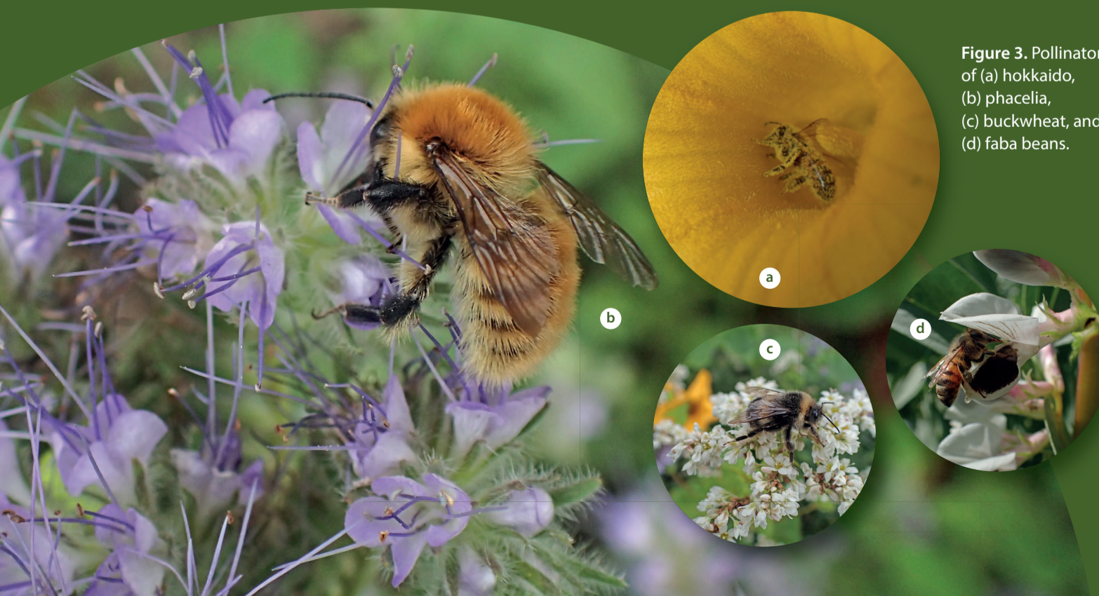
Figure 3. Pollinators of (a) hokkaido, (b) phacelia, (c) buckwheat, and (d) faba beans.