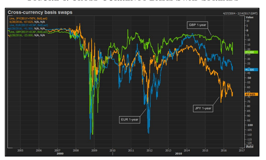
FIGURE 4: CROSS-CURRENCY BASIS SWAP SPREADS<sup>165</sup>

As Figure 4 clearly illustrates, basis swap spreads between the U.S. dollar and other major currencies have recently widened to levels last observed during the global financial crisis and subsequent European sovereign debt crisis. <sup>166</sup> The growing stress within these markets has been attributed to several factors, including: the sustained increase in the price of the U.S. dollar relative to the euro, pound sterling, and other major currencies over this period <sup>167</sup>; the ECB's negative interest