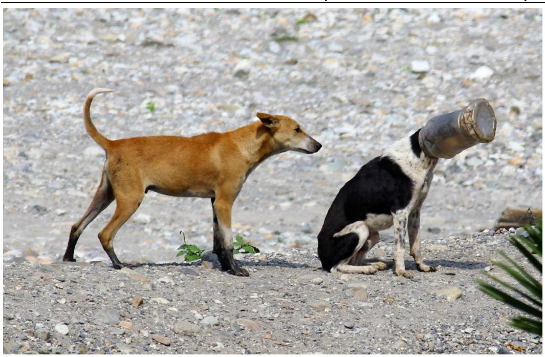
Photo 12: One of the consequences of plastic pollution in the Himalayan foothills: a dog choking on a plastic jar, found in the riverbed. Separate waste collection and disposal systems should be operated by the government to safeguard the sensitive ecosystems of the areas. Effective management design should be implemented for plastic waste generated in these mountain hamlets.