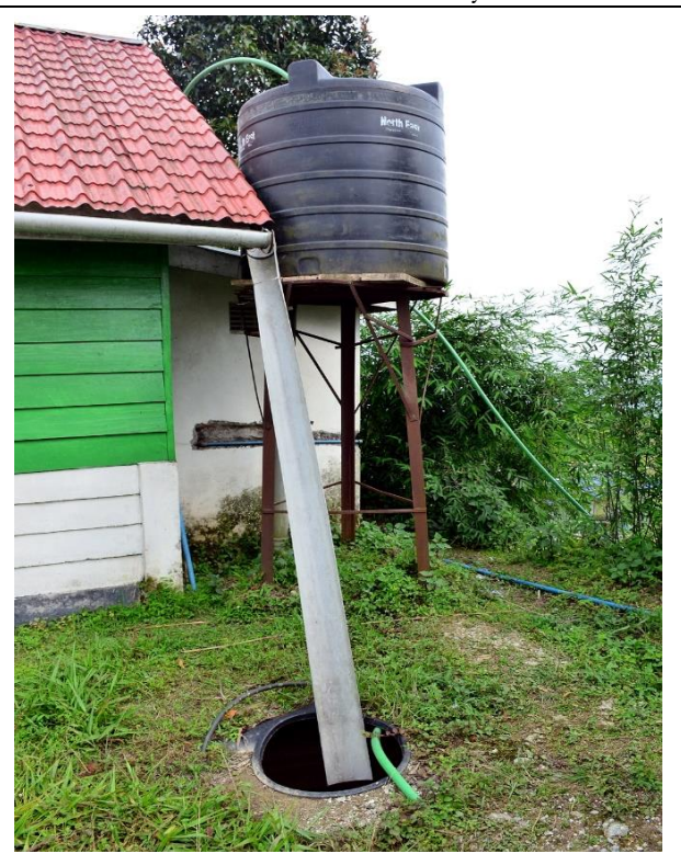
Photo 9: Local stream water flow has decreased during the summer and negatively impacted water availability for domestic use and irrigation. Ecotourism further increases water demand as tourist inflow is greatest during the summer. This image shows a local initiative of summer rainwater harvesting in one of the home stays in Darjeeling (Bhattacharya et al. , 2019).