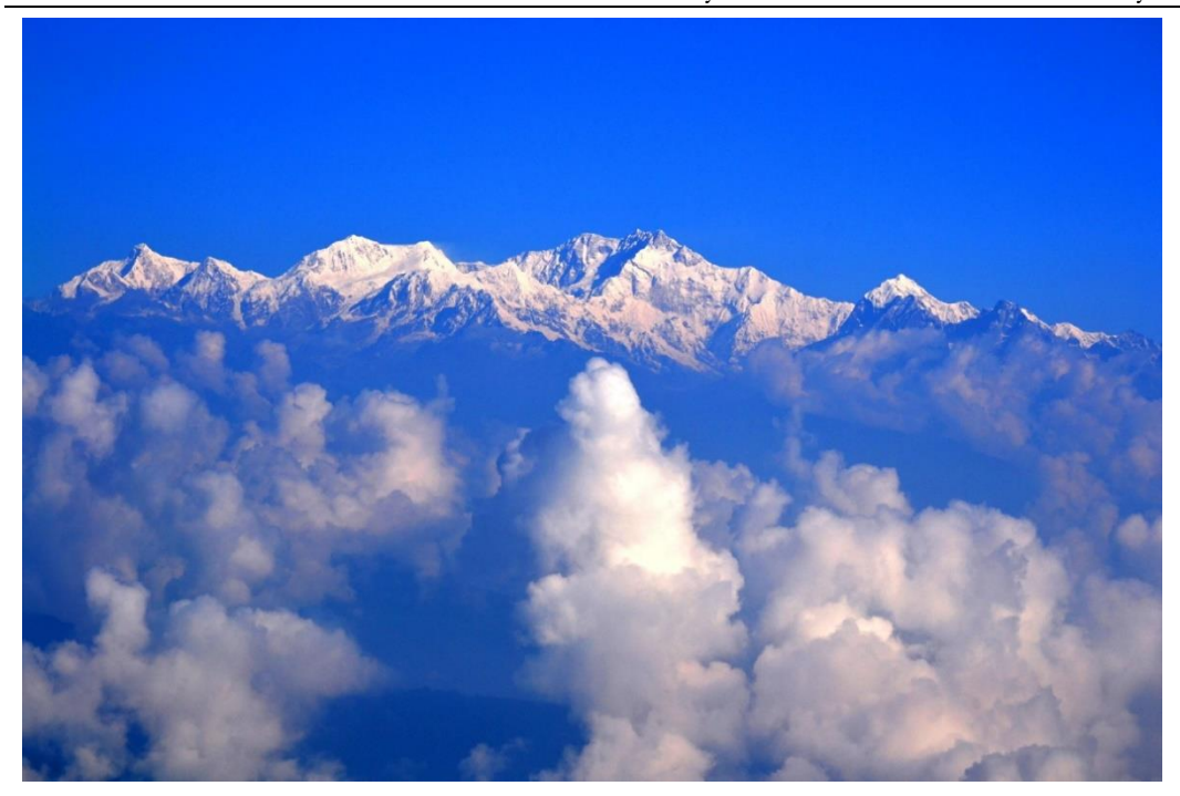
Figure 1: Kanchenjunga, the world's third largest mountain range, is situated in the Eastern Himalayas. The Kangchenjunga transboundary landscape is shared by Bhutan, China, India, and Nepal, and contains 14 protected areas with a total of 6,032 km<sup>2</sup>. The protected areas are habitats for several species of ecological importance.