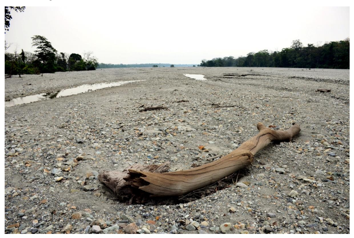
Figure 3: A dry riverbed in the foothills of the Eastern Himalayas in India. Recent changes in climatic conditions significantly affect water inflow in the Himalayan rivers. Changes in water flow can significantly impact Himalayan biodiversity and local livelihoods.

The next two photos portray how the water and snow content of a river and a lake, respectively, have altered in recent times, which may have a significant impact on local biodiversity and on the geological and geographical characteristics of the landscape.