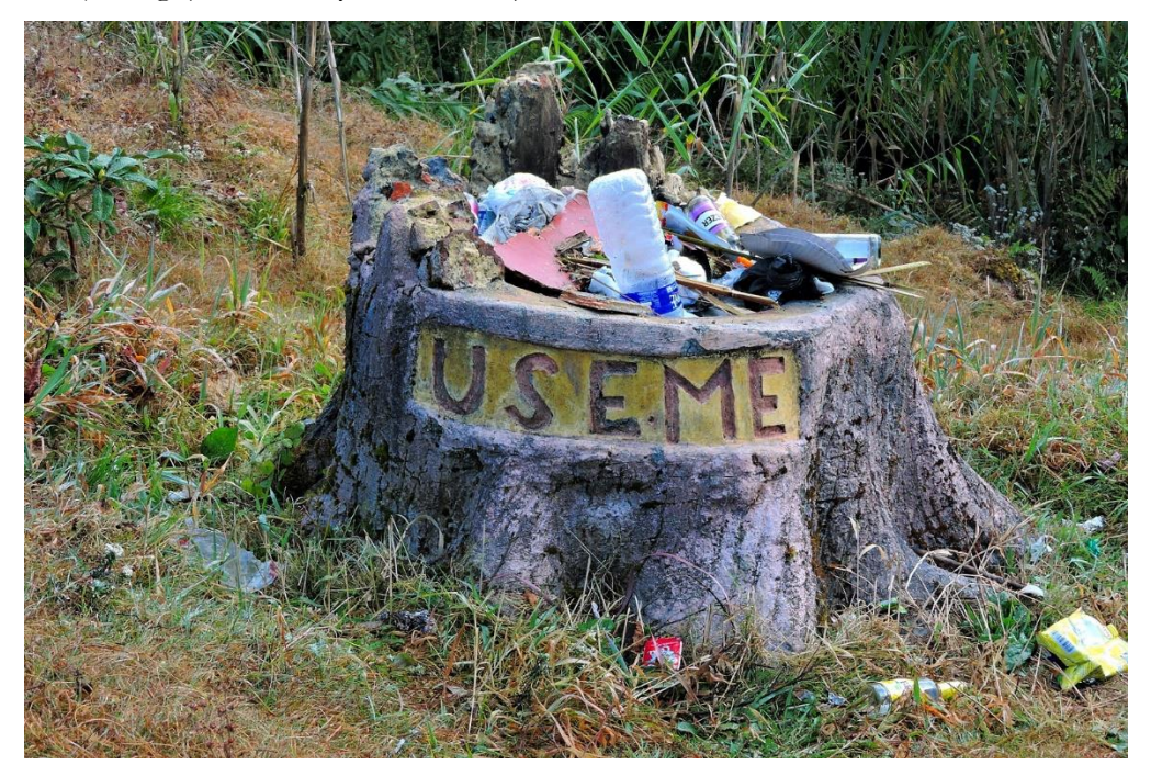
Photo 10: In the Eastern Himalayan hamlets, solid waste is collected in bins. Every community burns their solid waste once a week or buries the waste

Photo 9: Local stream water flow has decreased during the summer and negatively impacted water availability for domestic use and irrigation. Ecotourism further increases water demand as tourist inflow is greatest during the summer. This image shows a local initiative of summer rainwater harvesting in one of the home stays in Darjeeling (Bhattacharya et al. , 2019).