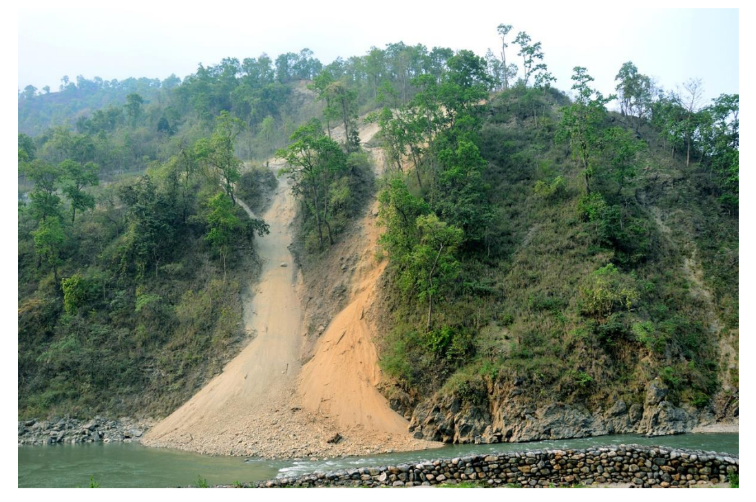
Photo 16: Landslide in the Kalimpong district in India due to the construction of roads. The eroded rocks and soil are deposited in the Teesta river. Some areas of the

Photo 15: Areas in Kalimpong district are overpopulated. Kalimpong city has recently been experiencing periodical water crises. Population pressure in these areas is a serious issue, which has adverse effects on natural resources and biodiversity and can increase the occurrence of natural and anthropogenic disasters like landslides and earthquakes. Technology and funding to develop low-cost earthquake-resistant and energy-efficient housing would be beneficial.