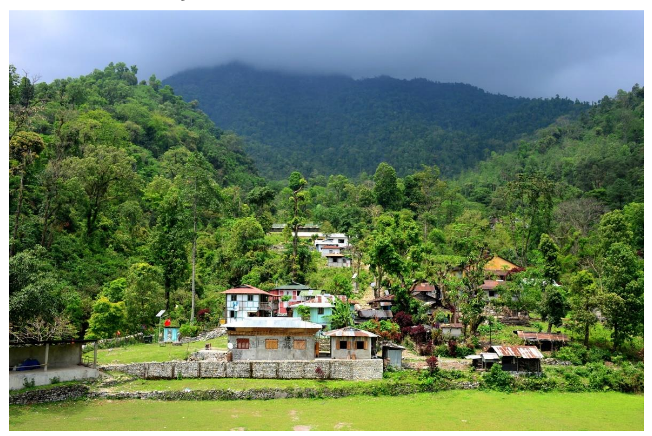
Figure 7: Tourism activities in the Eastern Himalayas have recently increased. The number of home stays and hotels has increased exponentially in the past ten years in many parts of the Eastern Himalayas. A surge in nature-based activities like trekking and hiking, bird watching, and camping and unrestricted tourist inflow can increase waste generation and consumption of water resources, which in turn can affect local biodiversity.

Among the administrative units, Darjeeling is the most vulnerable compared to Sikkim, eastern Nepal, and western Bhutan.