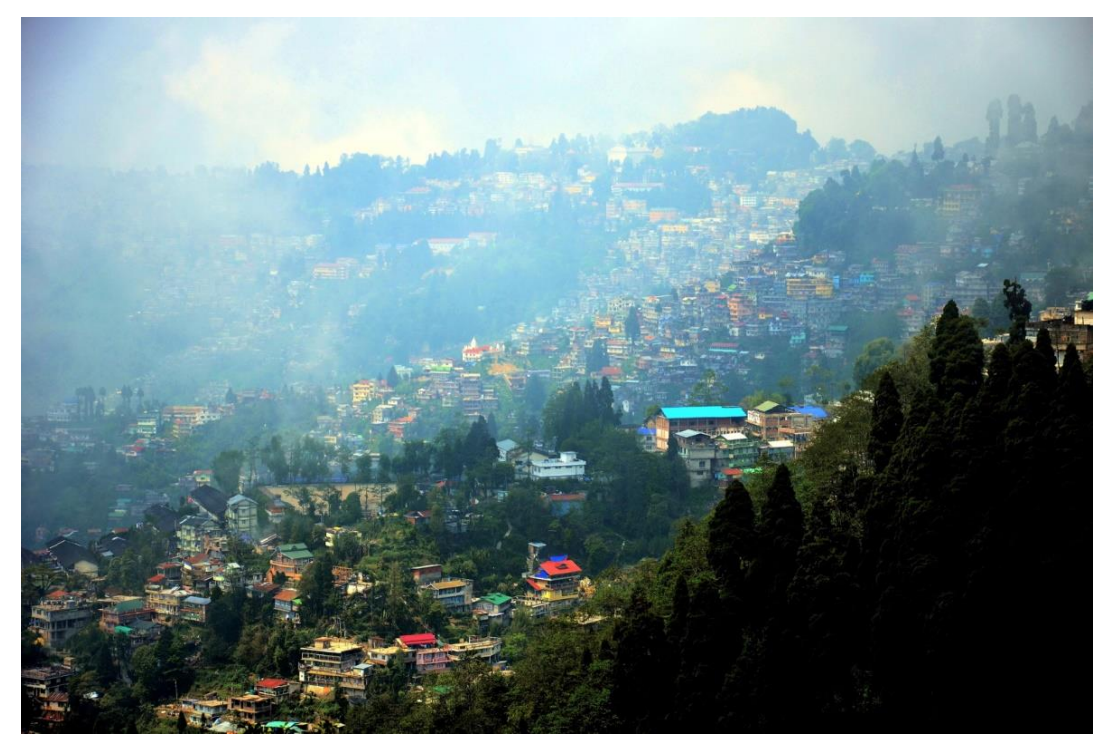
Photo 6: Darjeeling, India is one of the most popular tourist destinations in the Eastern Himalayas. The town experiences huge population pressures and tourist inflows.

Figure 5: A forest in the Eastern Himalayas in Darjeeling, India. Many scattered hamlets are found in the Eastern Himalayas and most of them are proximate to the forests enriched with endemic biodiversity. Many hamlets with indigenous inhabitants are in the forest areas. The spectacular view of the Himalayan ranges, forests, and biodiversity attracts tourists from different parts of the world.