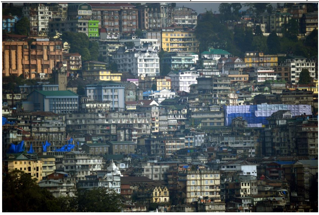
Photo 15: Areas in Kalimpong district are overpopulated. Kalimpong city has recently been experiencing periodical water crises. Population pressure in these areas is a serious issue, which has adverse effects on natural resources and biodiversity and can increase the occurrence of natural and anthropogenic disasters like landslides and earthquakes. Technology and funding to develop low-cost earthquake-resistant and energy-efficient housing would be beneficial.

Bhattacharya: Crisis in the Eastern Himalayas