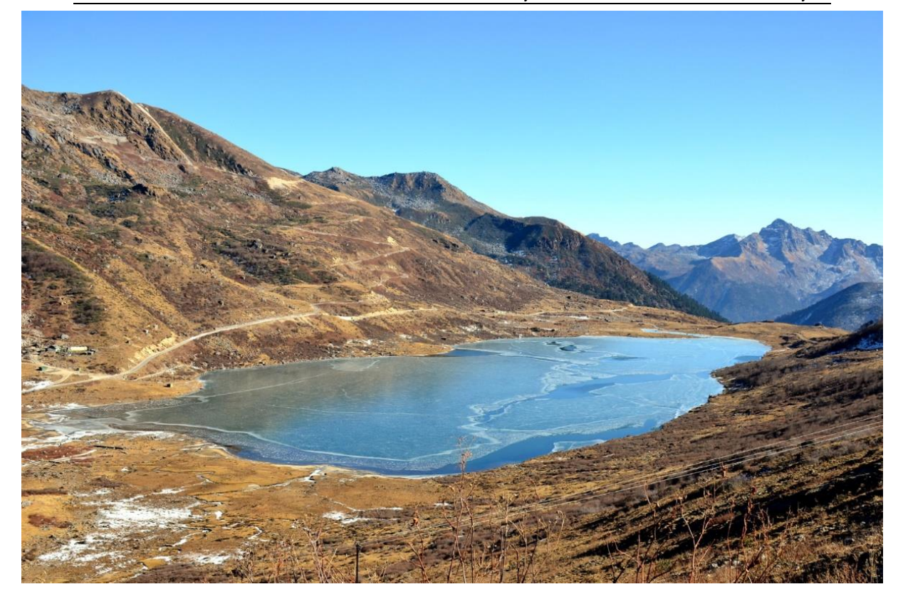
Figure 4: Tsomgo lake in Sikkim, India. The amount of snow has been significantly reduced in recent times, according to local sources. The photo was taken in December 2016. Hardly any snow is present, as opposed to some years back when the entire lake would be frozen.

The following four images display the potential of the Eastern Himalayas as an ecotourism destination and recent initiatives undertaken in ecotourism with the example of community-based ecotourism in the Darjeeling district of the Eastern Himalayas.