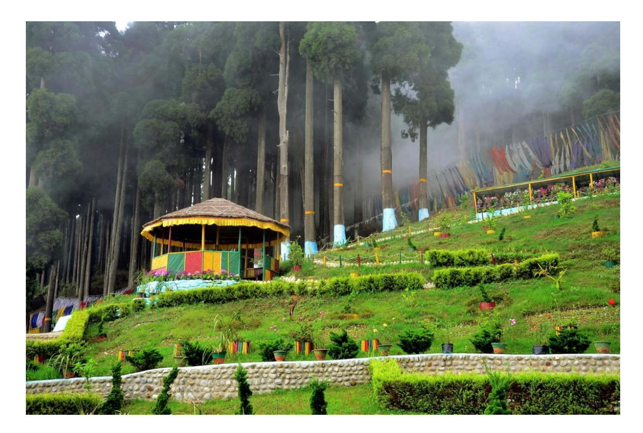
Figure 8: Community-based ecotourism in Lamahatta village, Darjeeling District, India. Ecotourism activities in Darjeeling district have been rapidly increasing. The carrying capacity assessment and sustainability of tourism are critical issues in the region as they will form the basis for resource allocation and future development.

Photos 9 through 13 illustrate the adverse effects of unplanned ecotourism, such as water crises, waste generation, and air pollution.