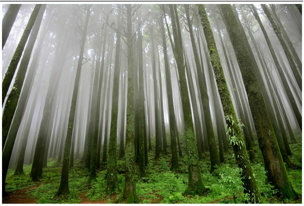
Figure 5: A forest in the Eastern Himalayas in Darjeeling, India. Many scattered hamlets are found in the Eastern Himalayas and most of them are proximate to the forests enriched with endemic biodiversity. Many hamlets with indigenous inhabitants are in the forest areas. The spectacular view of the Himalayan ranges, forests, and biodiversity attracts tourists from different parts of the world.