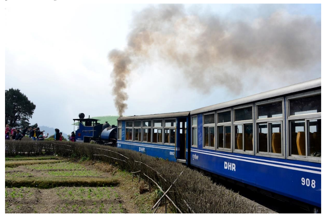
Photo 13: Air pollution in the Eastern Himalayas. The number of vehicles has increased significantly with tourist growth. The vehicles used in these areas should be monitored regularly so that pollution can be checked. The installation of modern

Photo 12: One of the consequences of plastic pollution in the Himalayan foothills: a dog choking on a plastic jar, found in the riverbed. Separate waste collection and disposal systems should be operated by the government to safeguard the sensitive ecosystems of the areas. Effective management design should be implemented for plastic waste generated in these mountain hamlets.