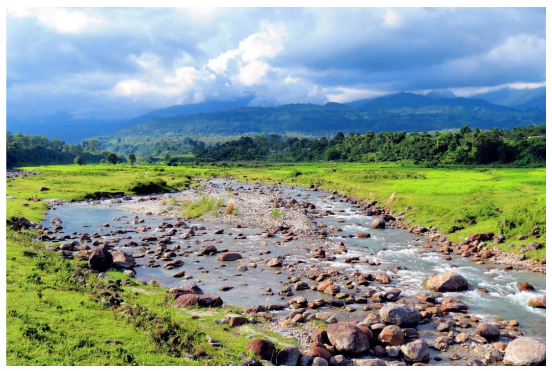
Figure 2: The Dooars are the floodplains in the foothills of the Eastern Himalayas. During floods, there is huge amount of erosion on the banks of rivers

Figure 1: Kanchenjunga, the world's third largest mountain range, is situated in the Eastern Himalayas. The Kangchenjunga transboundary landscape is shared by Bhutan, China, India, and Nepal, and contains 14 protected areas with a total of 6,032 km<sup>2</sup>. The protected areas are habitats for several species of ecological importance.