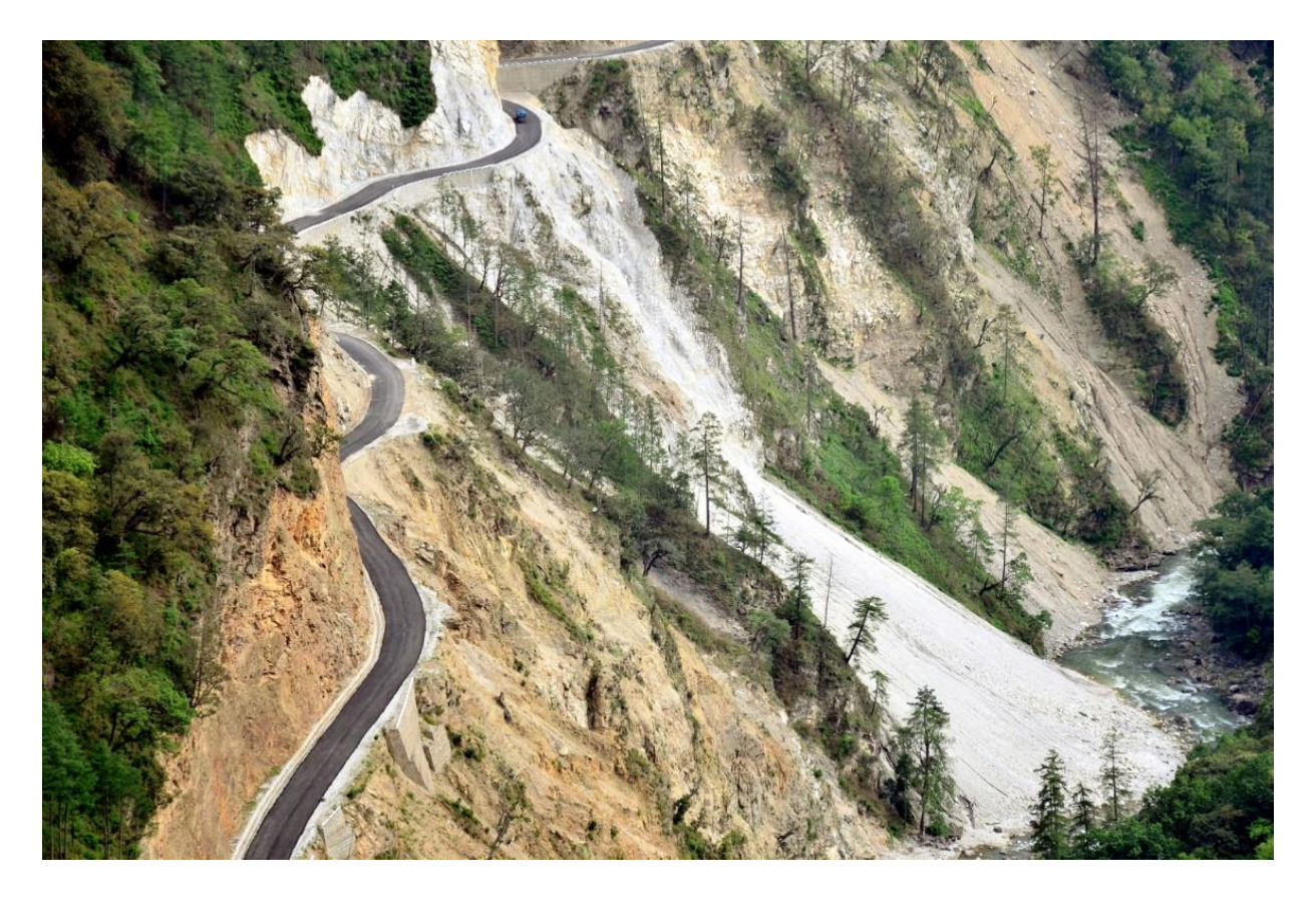
Photo 14: Road construction has led to soil erosion, slope destabilization. and landslides. Railway tracts run through forest areas in the Himalayan foothills. Consequently, railway accidents result in deaths of wild animals. Railway and road construction in the region should be inspected thoroughly after proper study of the corridor networks and management strategies.

The final photos of this essay highlight recent developmental and construction activities in the Eastern Himalayas and how these activities, along with population pressure, pose a grave threat to local ecosystems, biodiversity, and indigenous communities.