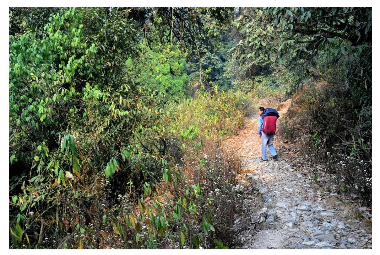
Photo 11: Trekking is common in the Eastern Himalayas, which leads to plastic pollution and waste deposition in the mountain areas. Inorganic solid waste can create health hazards in human and livestock populations and can harm the growth of vegetation and crops. The problem of solid waste management (SWM), particularly in trekking areas, is one of the major issues to be tackled in the Eastern Himalayas.

underground. Waste burning is a daily practice for many homestays with high tourist pressure. The burial and burning of bottles and plastic packets may have serious effects on the local ecosystem and biodiversity (Bhattacharya et al. , 2019).