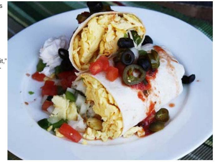
Photo caption: The Griz Breakfast Burrito is available Monday through Friday at the Cascade Country Store.

For more information call Voyles at 406-243-5089 or email <a href="mailto:christina.voyles@mso.umt.edu">christina.voyles@mso.umt.edu</a>.