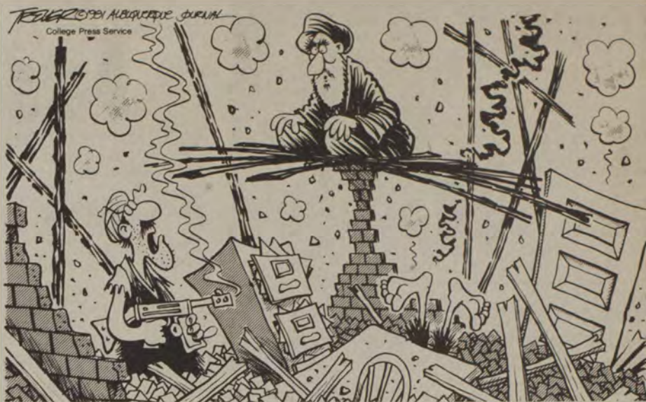
"PARDON, IMAM, WE WERE DRAFTING YOUR STATEMENT ON IRAN'S REMARKABLE STABILITY — AND THERE WAS A SLIGHT DISAGREEMENT OVER WORDING...."