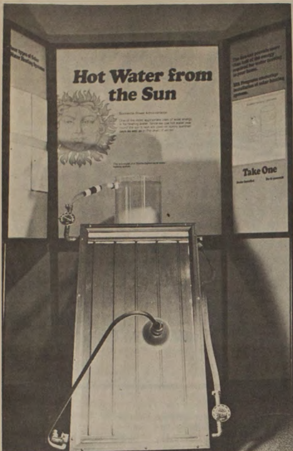
SOLAR ENERGY COLLECTION PANELS use the lamplight to heat a tank of water, at the Alternative and Renewable Energy Resources Conference.