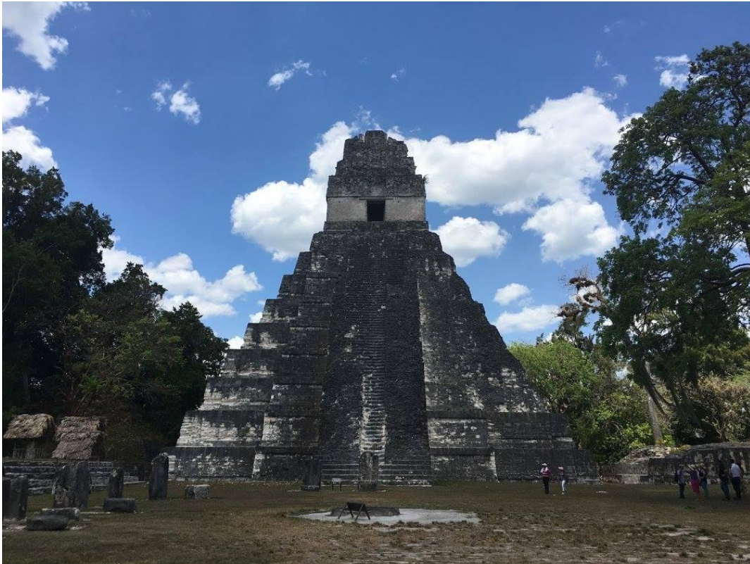
Temple I in the ancient Maya city of Tikal in present day Guatemala