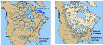
Figure 1: The Bell River basin before the ice sheet cut it off and rerouted drainage to modern systems. Sears, 2013