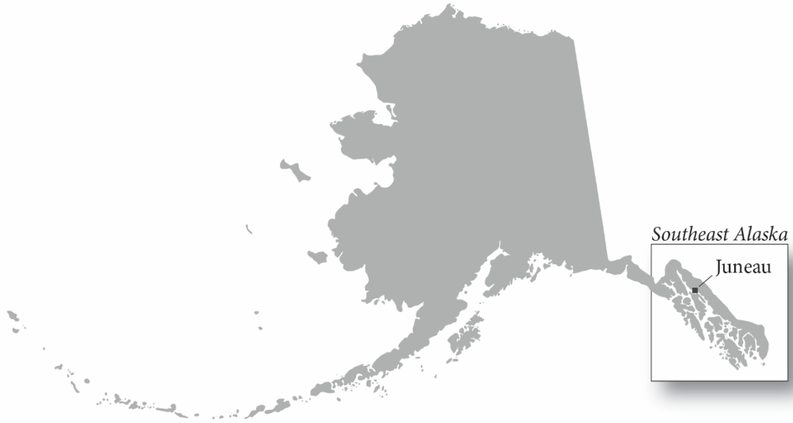
Figure 1. Southeast Alaska regional locator map