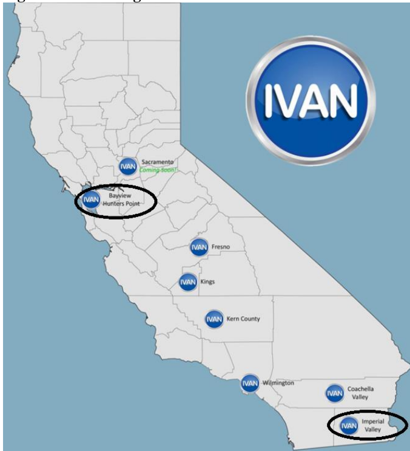
Figure 3. IVAN Regions

This figure displays the seven regions where IVAN operates and an eighth planned in Sacramento. The sites of the two case studies in this research are circled.