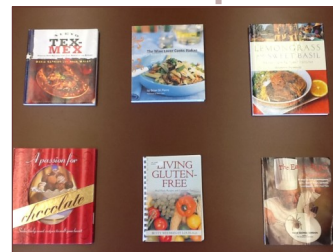
New Cookbooks at Missoula College Library

Missoula College has the state's largest collection of cookbooks, and it is now even bigger! This summer, Missoula College received a donation of over 500 cookbooks. These cookbooks, covering virtually everything culinary, can be checked out by any Montana resident, and anyone affiliated with UM can place a hold on any of our cookbooks from their location and have them delivered to your campus. Just search for "cookery" in the library catalog or come over to browse at the Missoula College library, located in the Administration Building (AD) building at 909 South Avenue West.