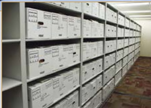
Senator Max Baucus' papers being unloaded on August 5, 2014 and housed in the Mansfield Library.