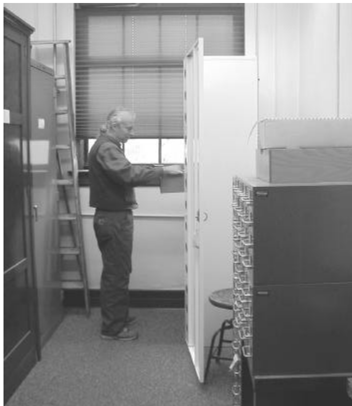
Non-vascular room at the UM Herbarium (botanist for scale)