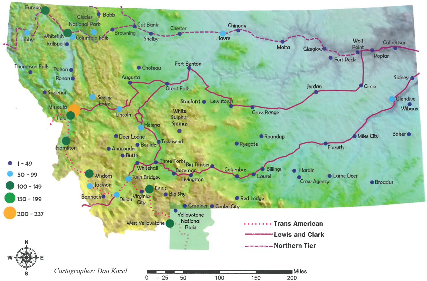
Figure 2 Overnight Location of Touring Cyclists in Montana