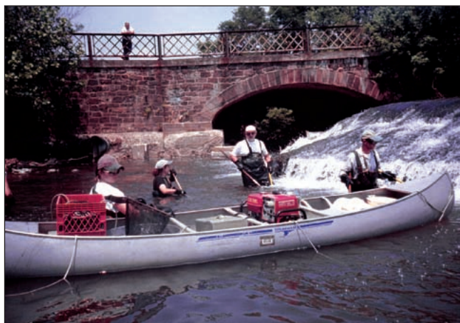
Figure 5. The effectiveness of dam removal as a method of river restoration is being evaluated in several regions of the US. (left) Scientists from Philadelphia's Patrick Center for Environmental Research study the removal of the 2-m high milldam on Manatawny Creek in southeast Pennsylvania in Aug 2002, (right) after documenting ecological conditions before the dam was removed (Bushaw-Newton et al. 2002).