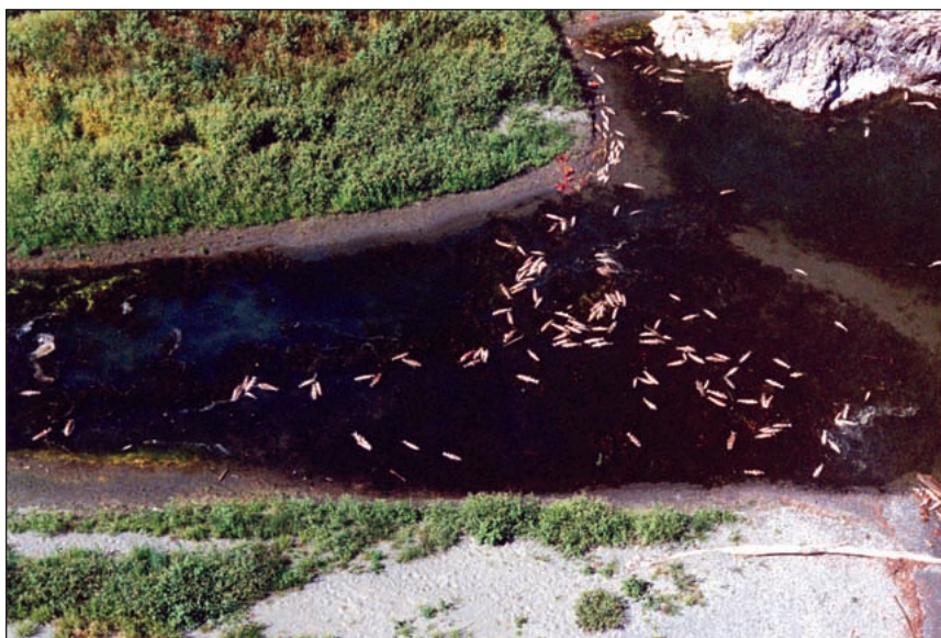
Figure 1. Dead salmon in the Klamath River, September 2002.

Already, scientists in North America, South Africa, Australia, New Zealand, and Europe are actively advising the public and river managers on the necessary quantity and timing of river flow needed to maintain desired ecological characteristics. Such advice is being provided in diverse political contexts, ranging from the cooperative to the controversial. In the US, scientists have helped guide efforts to recover endangered species in rivers like the Klamath, the Colorado, and the Missouri (NRC 2002b), to restore degraded flagship ecosystems such as the Florida Everglades (Holling et al. 1994), and to define the flows needed to protect ecological integrity on federally-owned lands (NPS 1996). In addition, scientists are now being