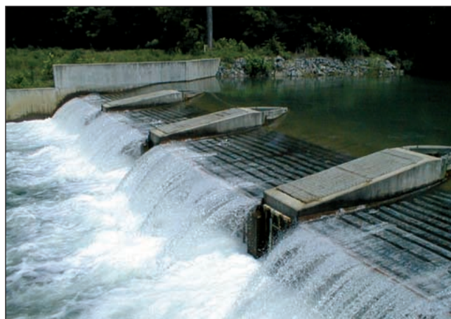
Figure 2. Improvements in Tennessee Valley Authority dam operations include (left) surface water pumps in the Douglas Reservoir (French Broad River, NC), designed to push oxygenated water from the surface to deepwater turbines, and (right) infuser weirs downstream of Chatuge Dam (Hiawassee River, NC), designed to provide both minimum flow and dissolved oxygen.